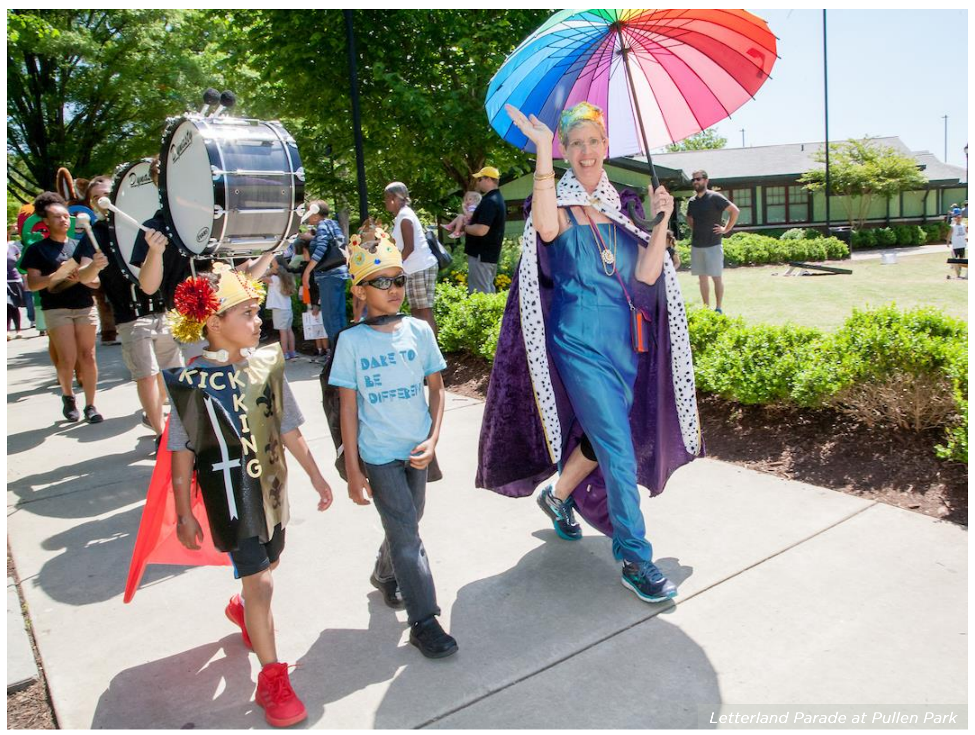
CITY OF RALEIGH HISTORIC RESOURCES AND MUSEUM PROGRAM STRATEGIC PLAN 6