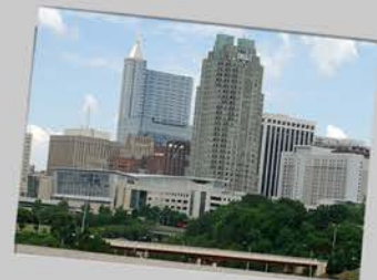
KODACHROME MAKE IN USA