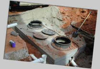
KODACHROME MAKE IN USA