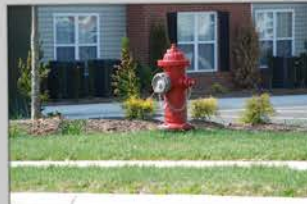
KODACHROME MAKE IN USA