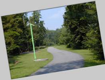
KODACHROME MAKE IN USA