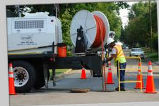
KODACHROME MAKE IN USA