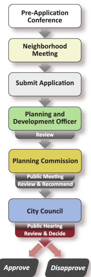
Rezoning procedure flow chart. See UDO Sec. 10.2.4.

Applicants for a PD District designation must complete the "Master Plan Application" portion of the rezoning application form. The submittal requirements are listed below.