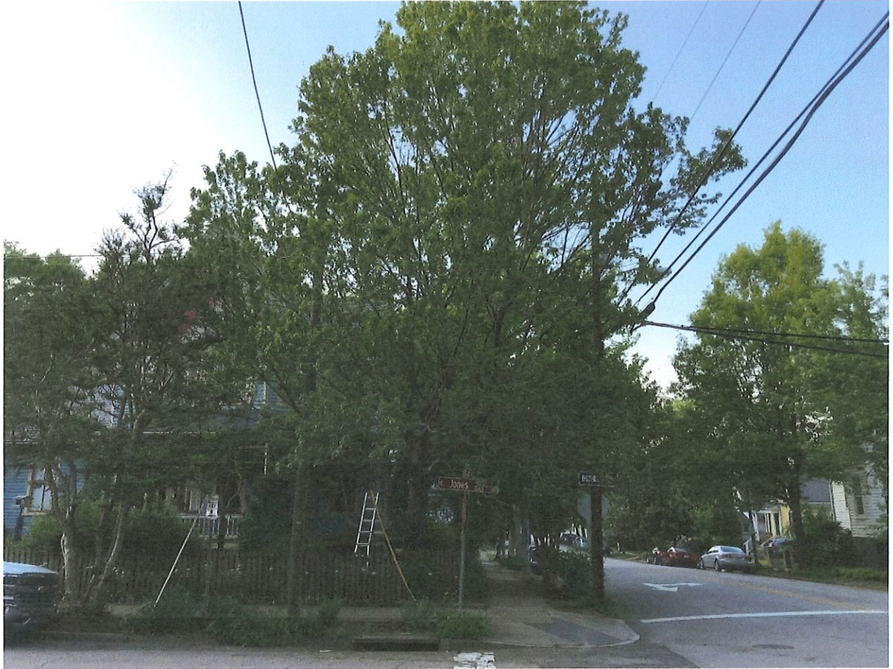
Figure 5. Looking north on the corner of E Jones St.