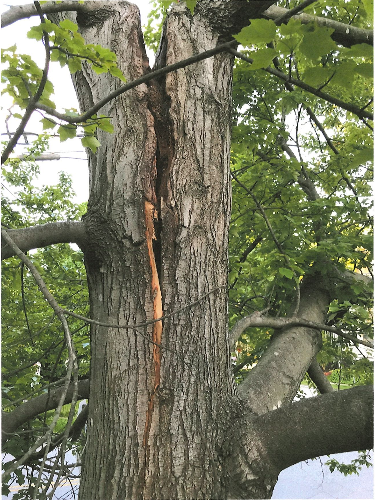
Figure 2. Crack in the trunk of the maple tree from the western side.