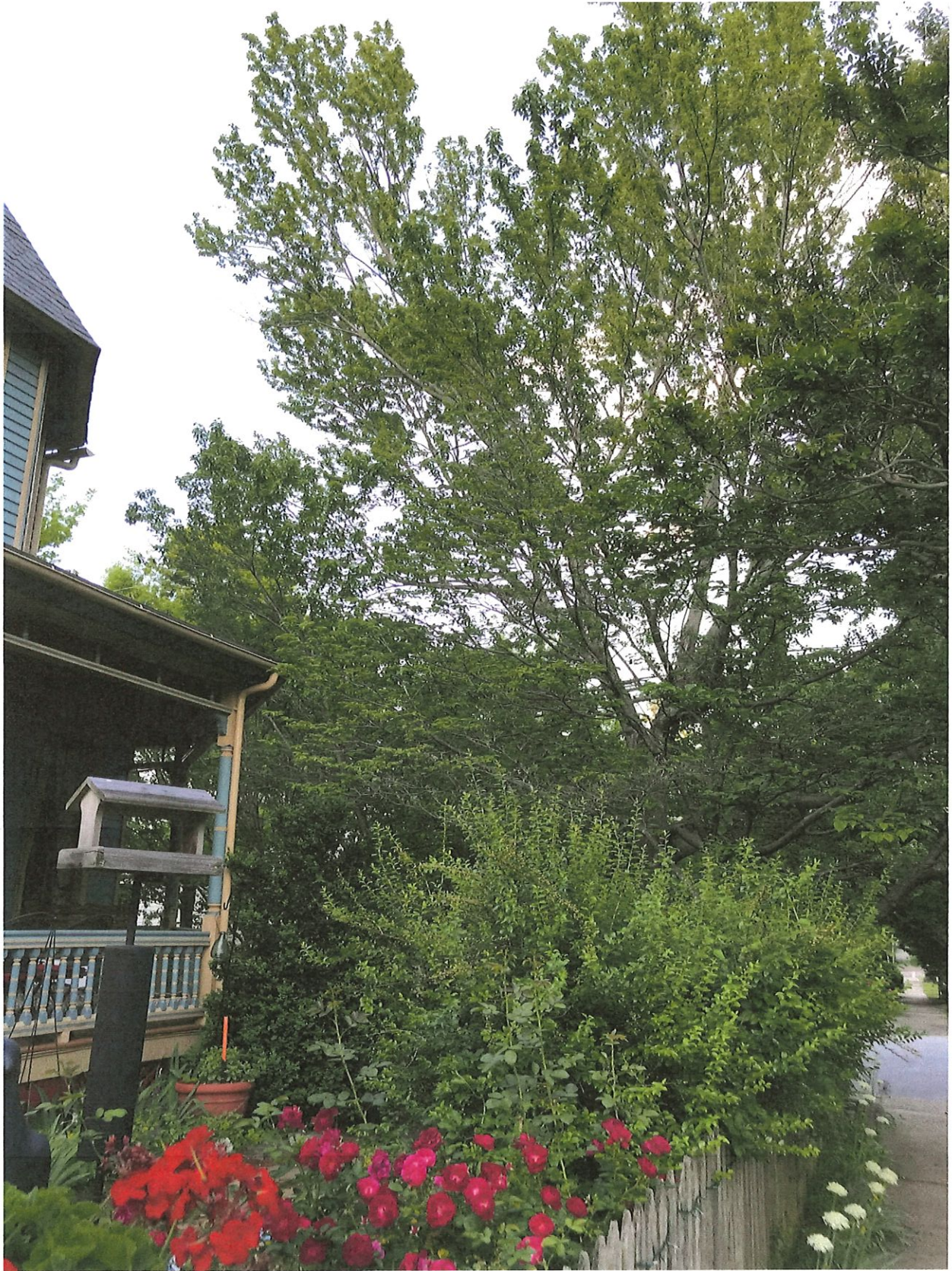
Figure 4. View of upper branches looking east along Jones St.