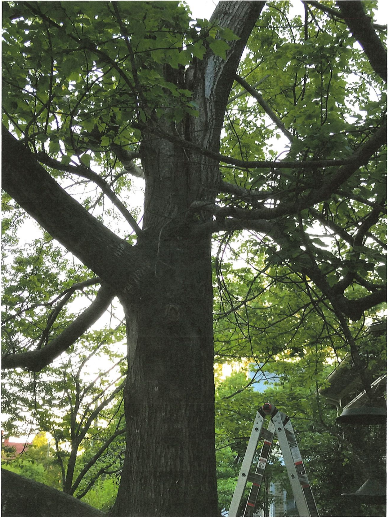
Figure 6. Split viewed from the eastern side.