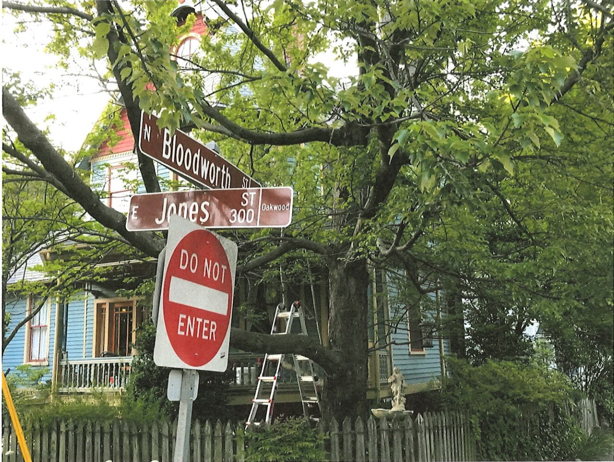
Figure 3. The maple tree on the south east corner of the lot, with the street sign for E Jones and N. Bloodworth streets shown for orientation.