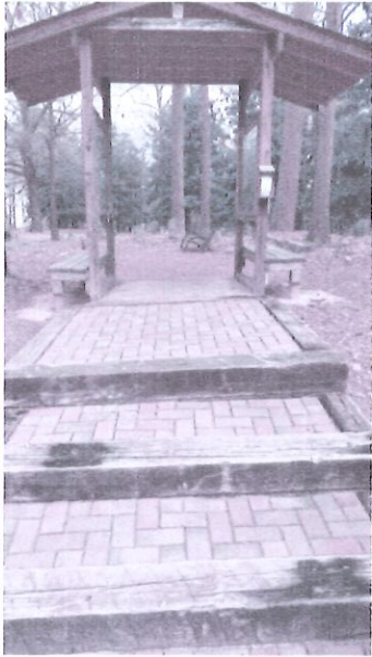
View showing sidewalk and area to left and right