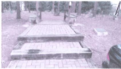
Existing Plaque on Right