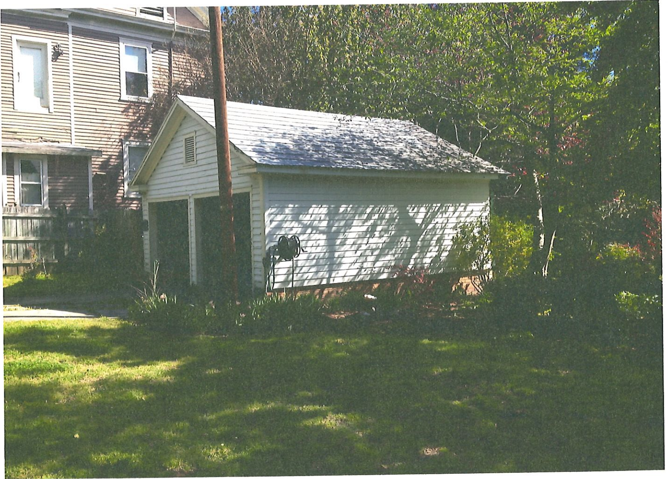
Garage at 416 N Bloodworth St.