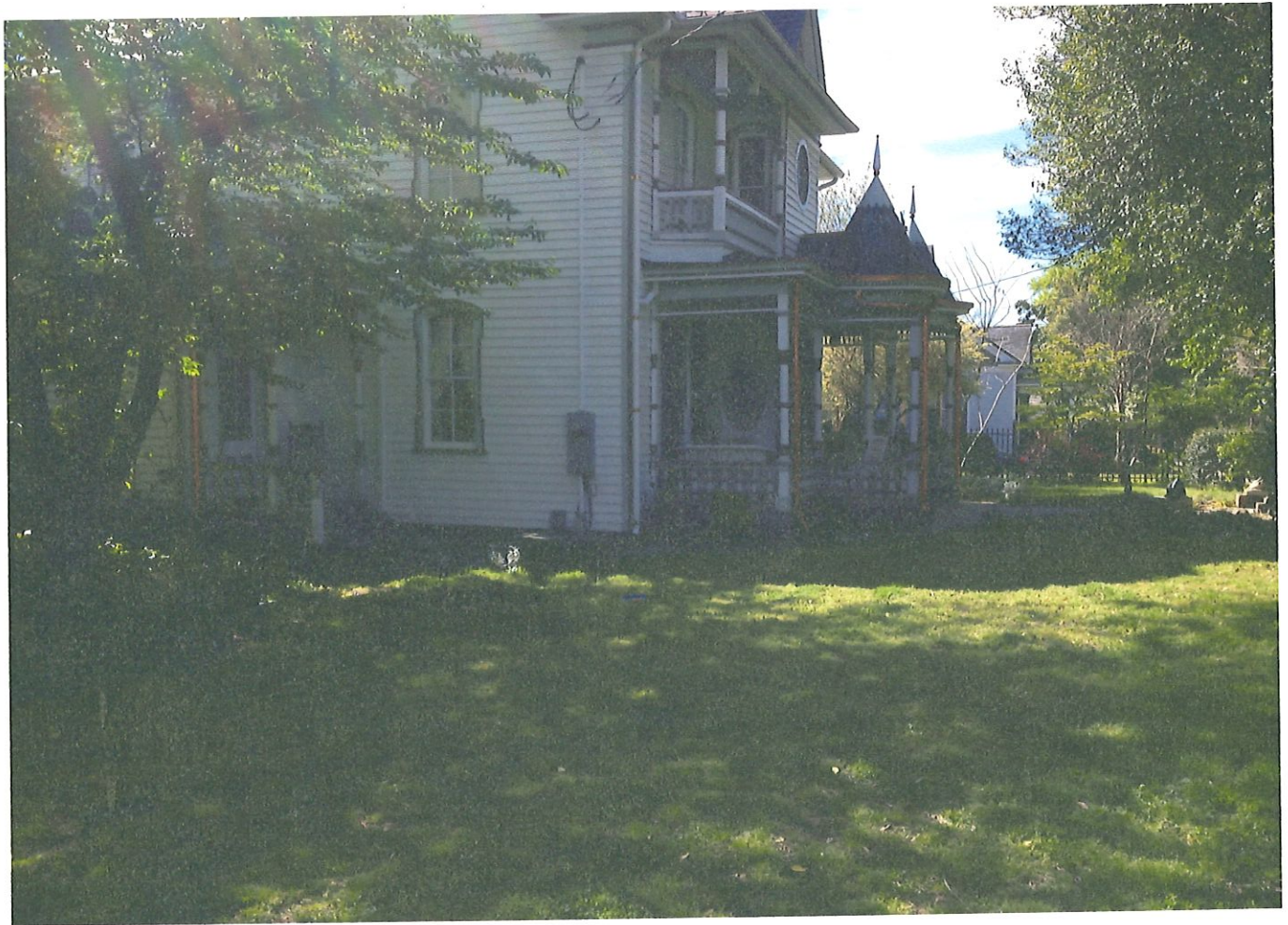
View of house at 414 N Bloodworth St. The garage is on 416 N Bloodworth St.