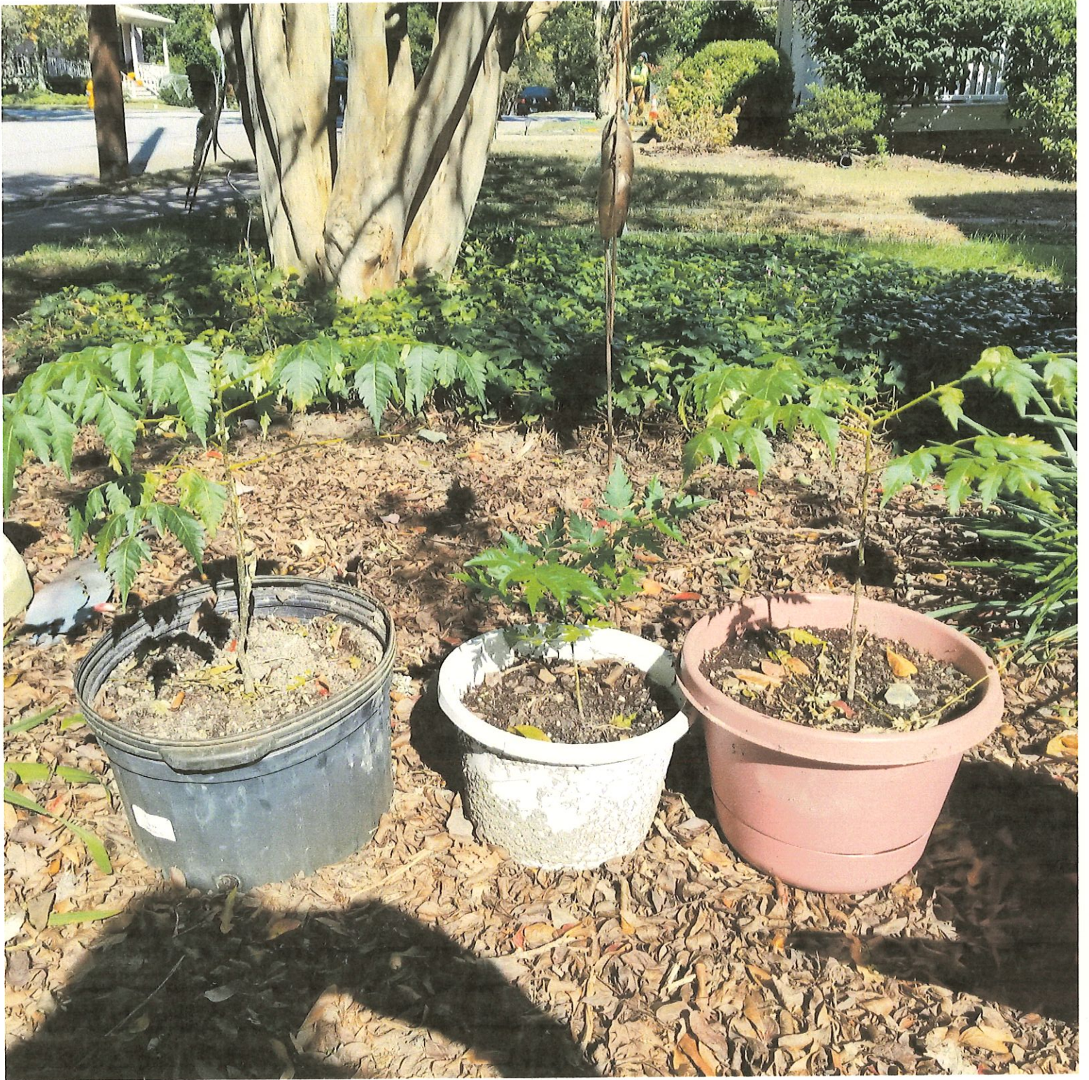
potential replacement trees.