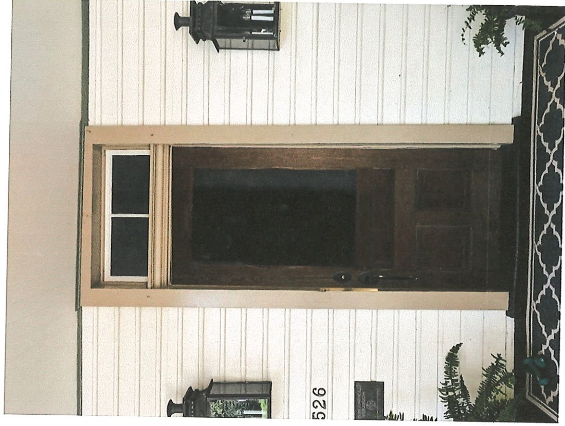
Proposed Front Door