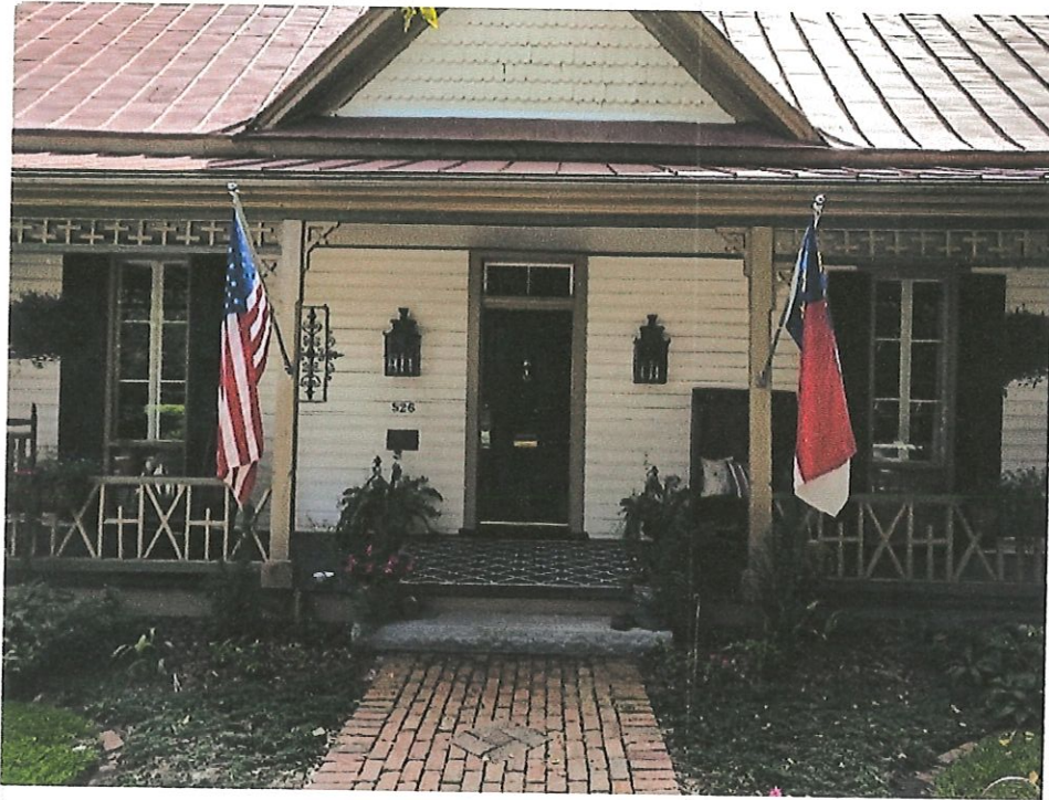
Existing Front Door