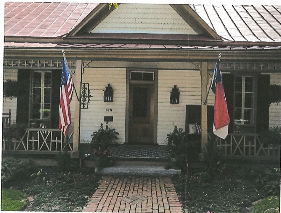
Proposed Front Door