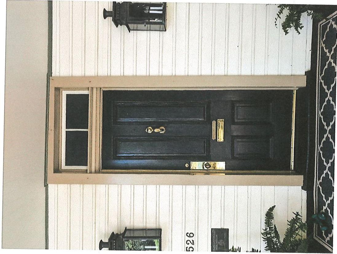
Existing Front Door