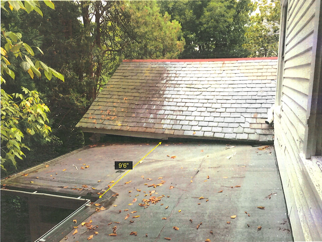
Coolant lines will be placed in white downspout material and only run on rear wall of the home.

For new HVAC system, rear yard of the property is bricked into a patio and too narrow for ground-mounted exterior units. Initially we looked into side yard placement, but realized the exterior compressor could be installed on the rear flat roof above the mud room.