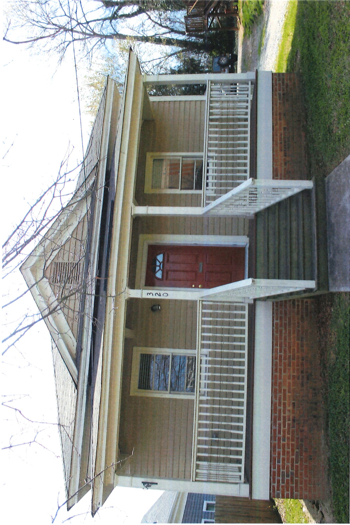
320 E Davie Street, Raleigh, NC 27601 Existing