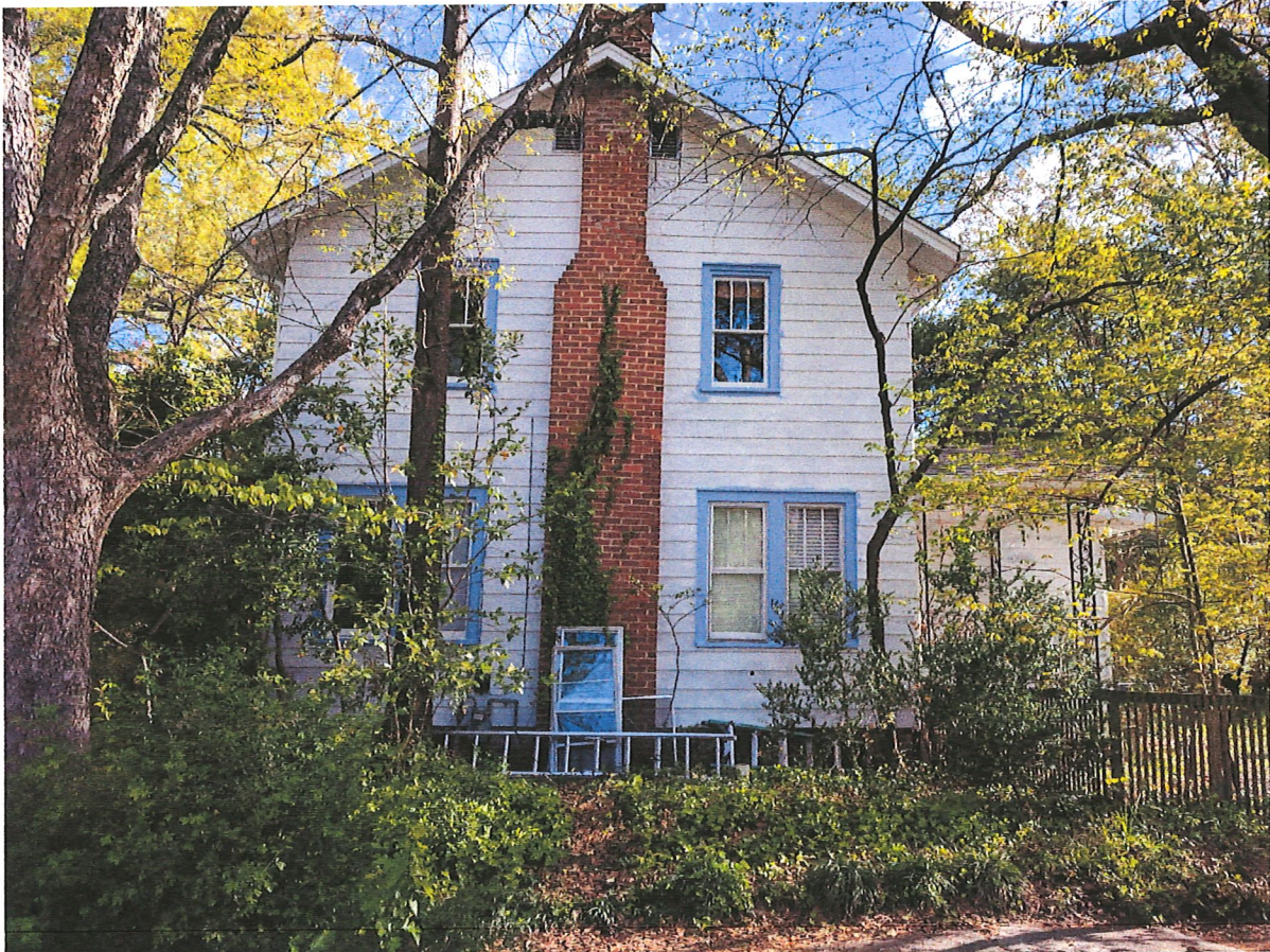
Illustration 2: Dorothea Drive View