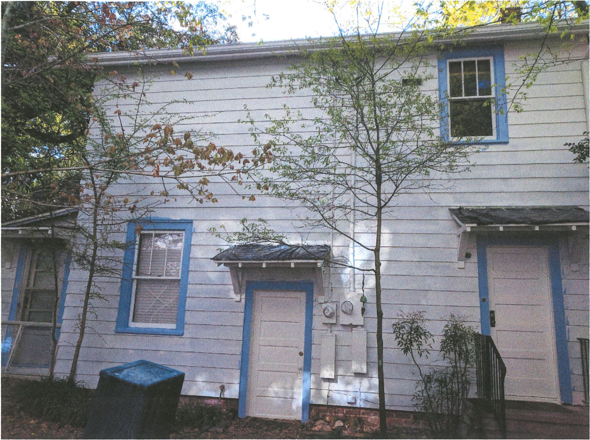
Illustration 3: West Side Yard View