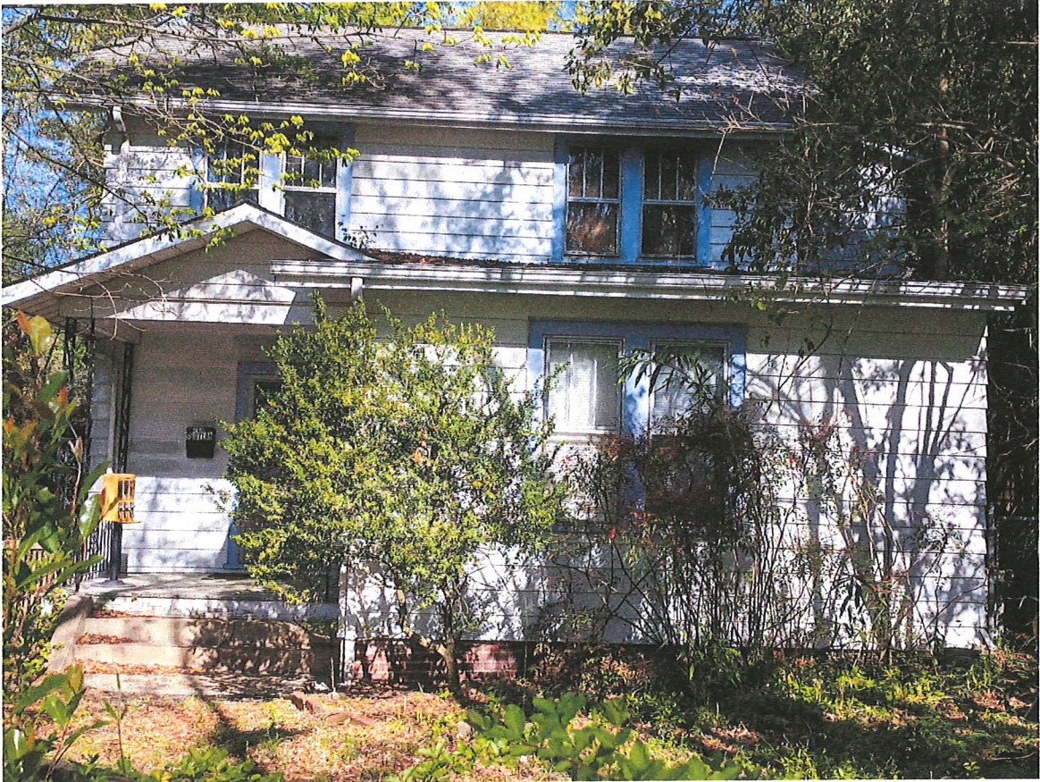
Illustration 1: Boylan Avenue View