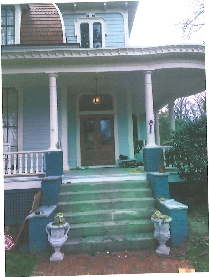
What we found when attempting to repair