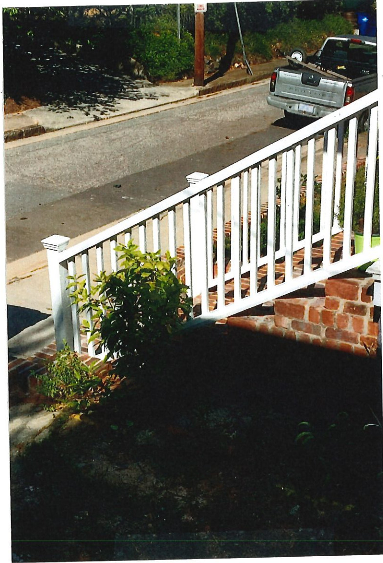
Neighbor's Stairs —