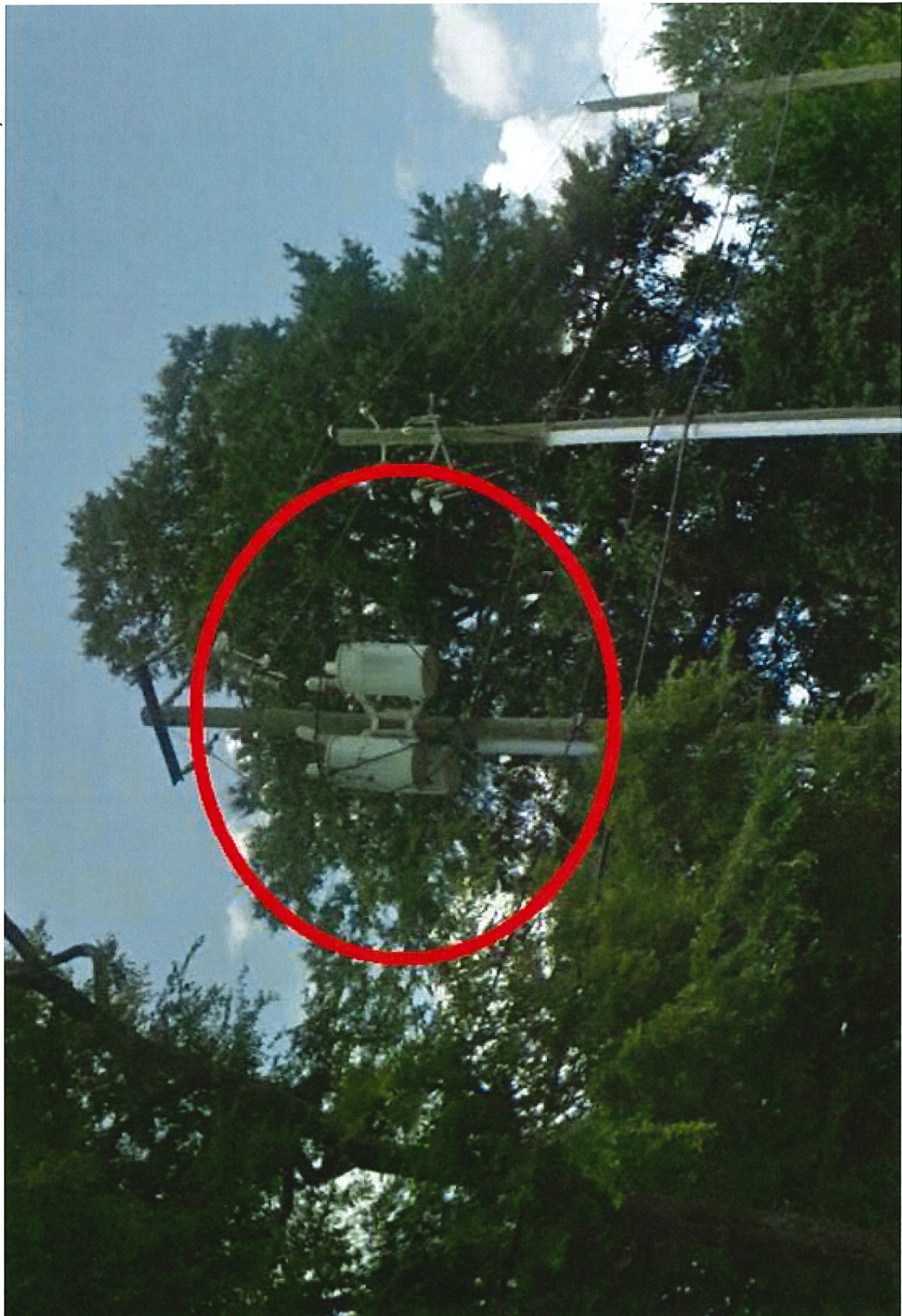
POLE-MOUNTED, THREE-PHASE TRANSFORMER