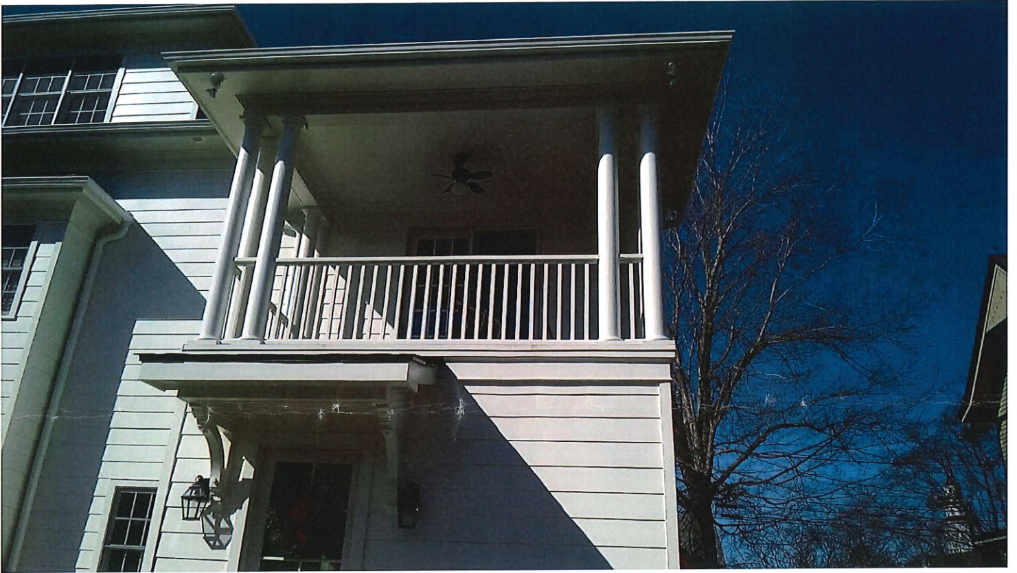
UPPER REAR PORCH