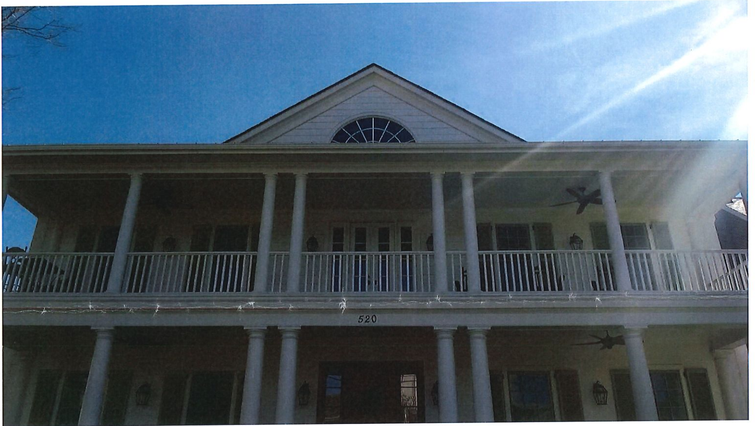
UPPER FRONT PORCH