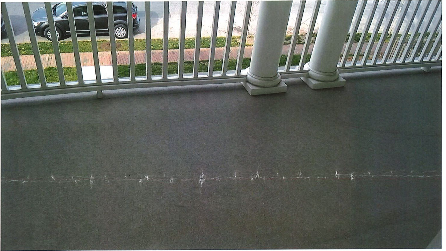
CURRENT FRONT PORCH FLOORING