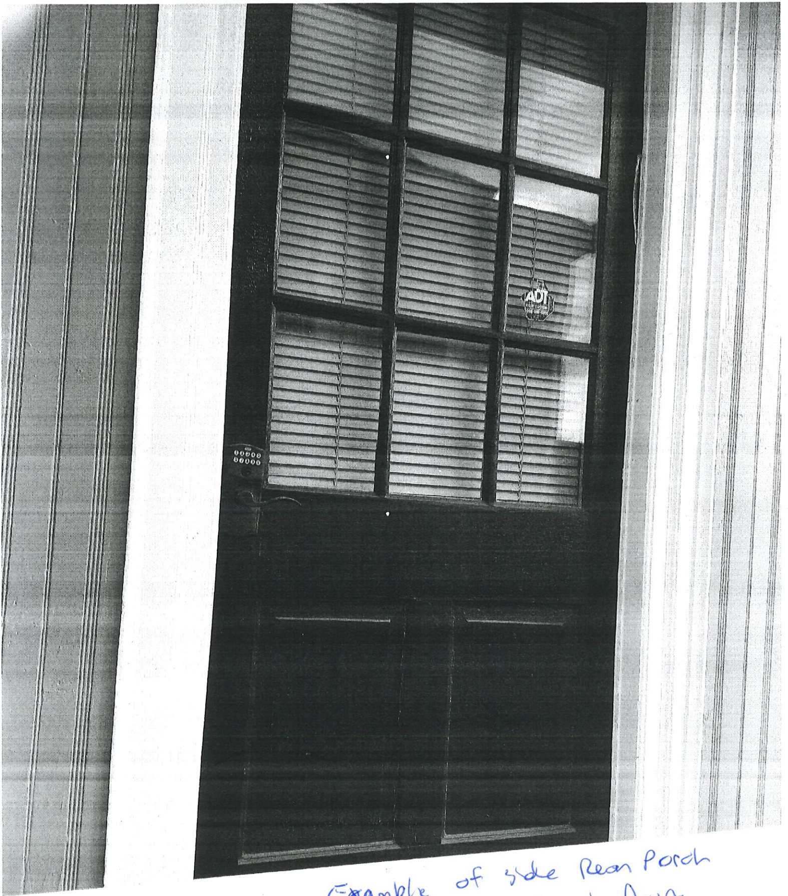
Example of side Rear Porch like Replacement Door