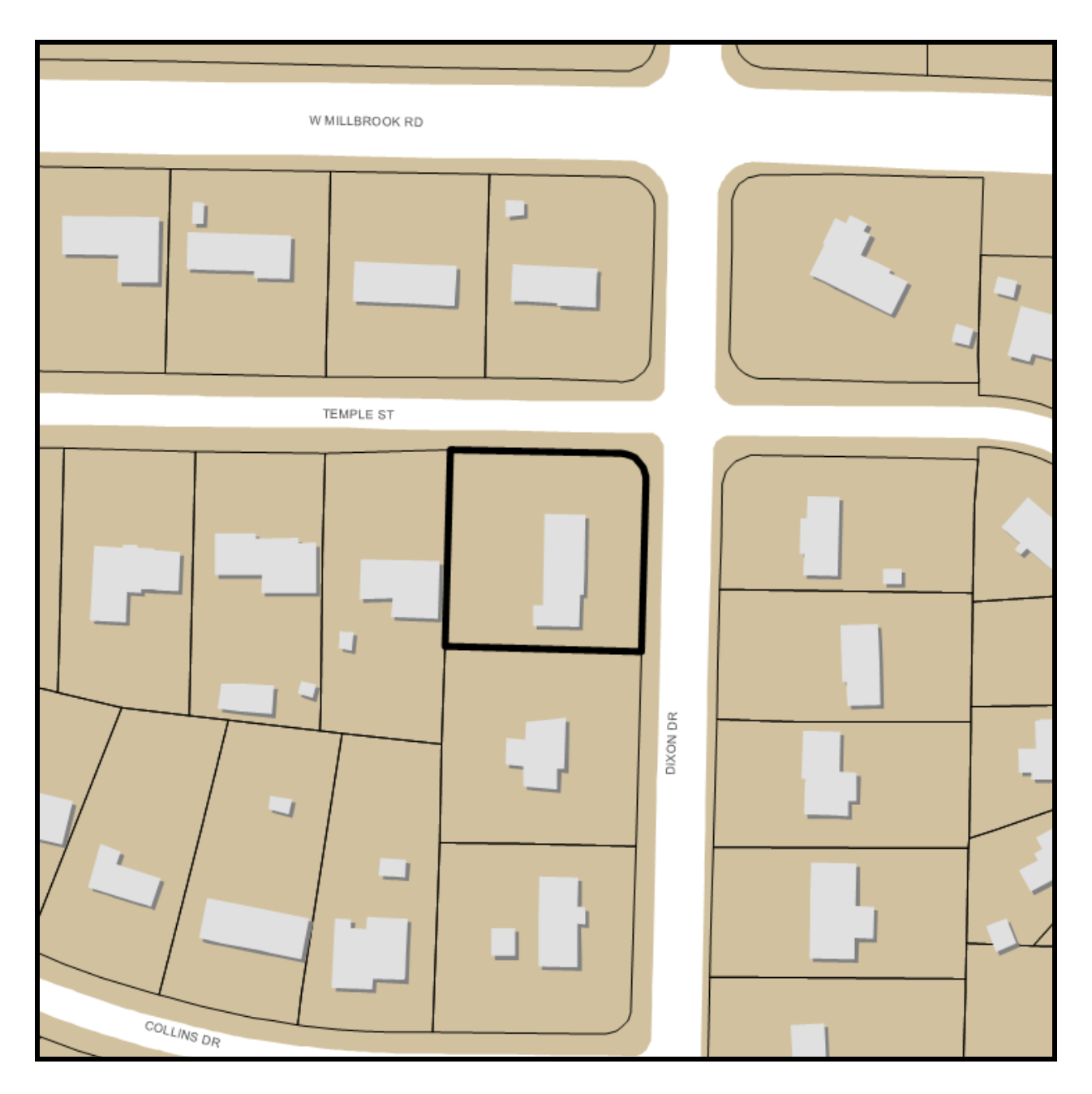
Location Map - 5313 Dixon Drive