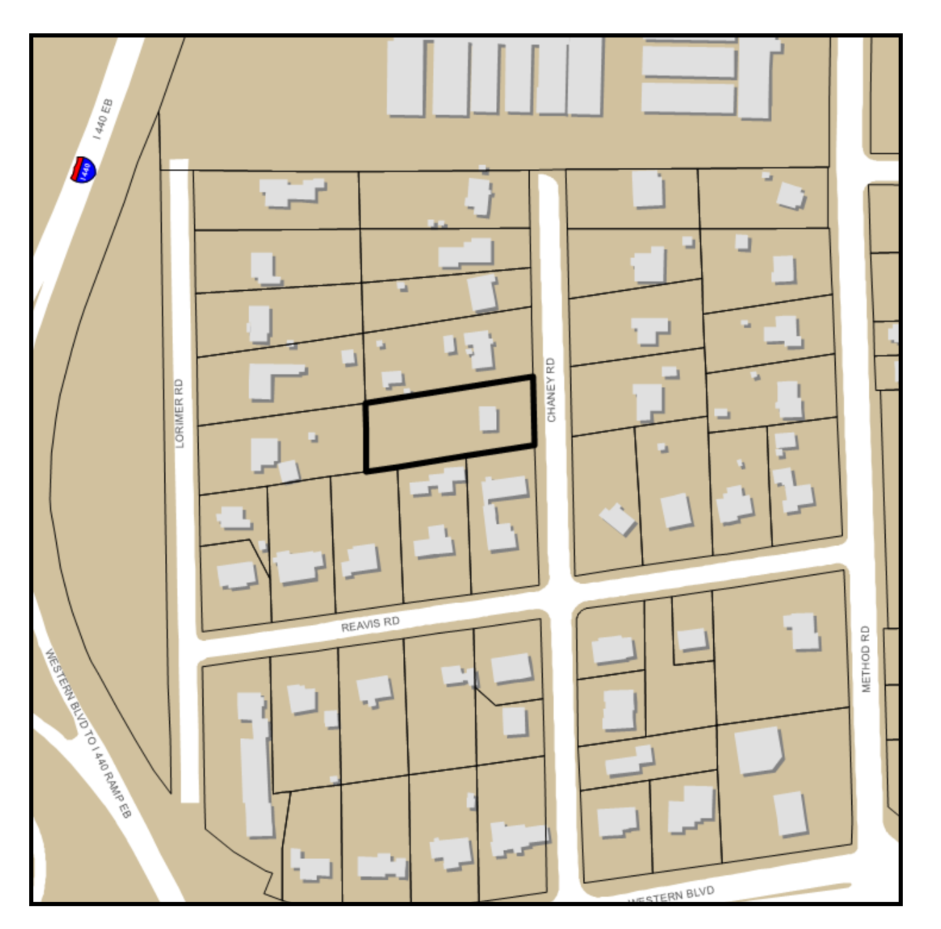
Site Map - 910 Chaney Road