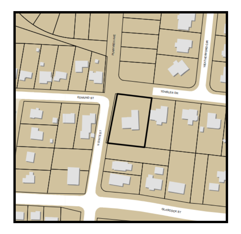
S-2-16 Location Map