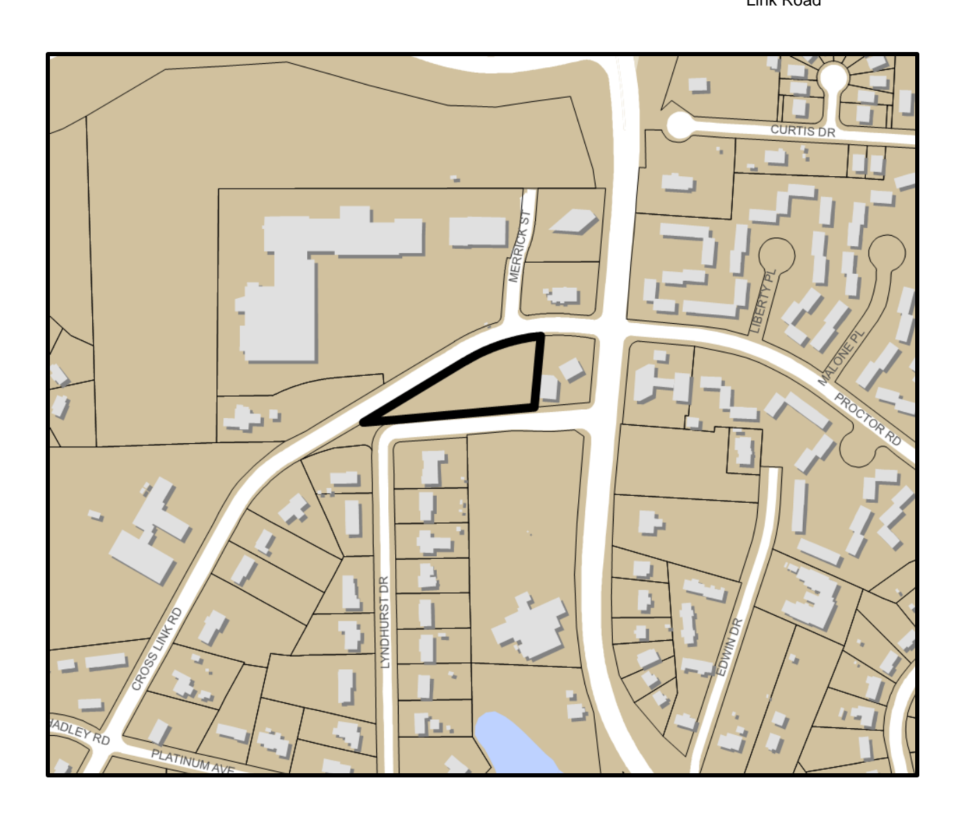
SR-82-16 Location Map