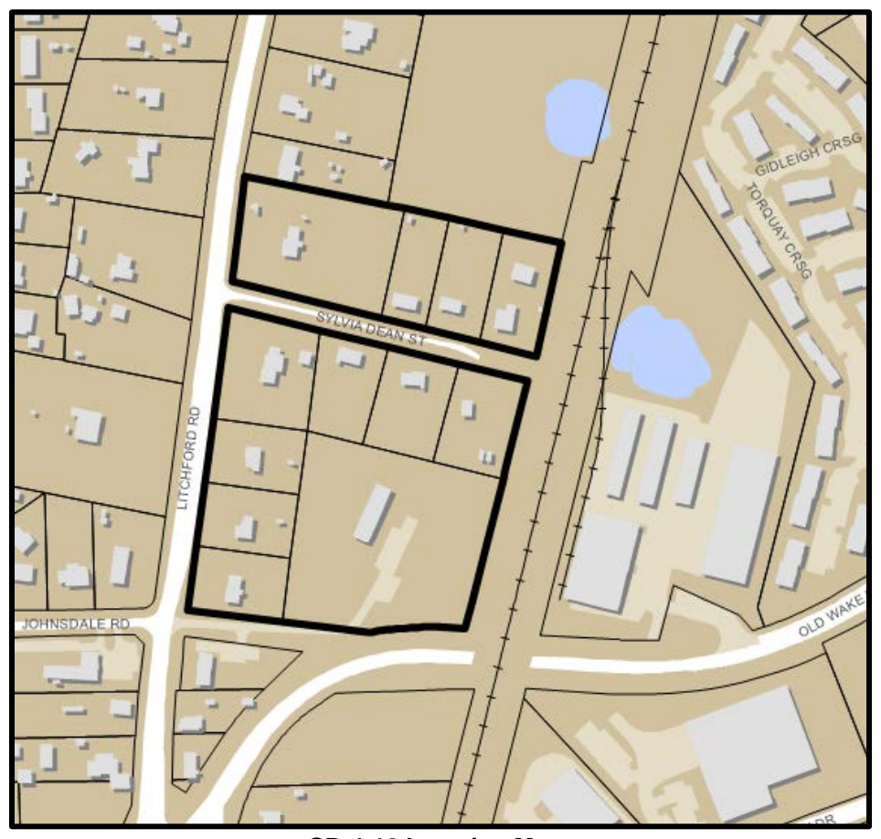
SR-4-16 Location Map