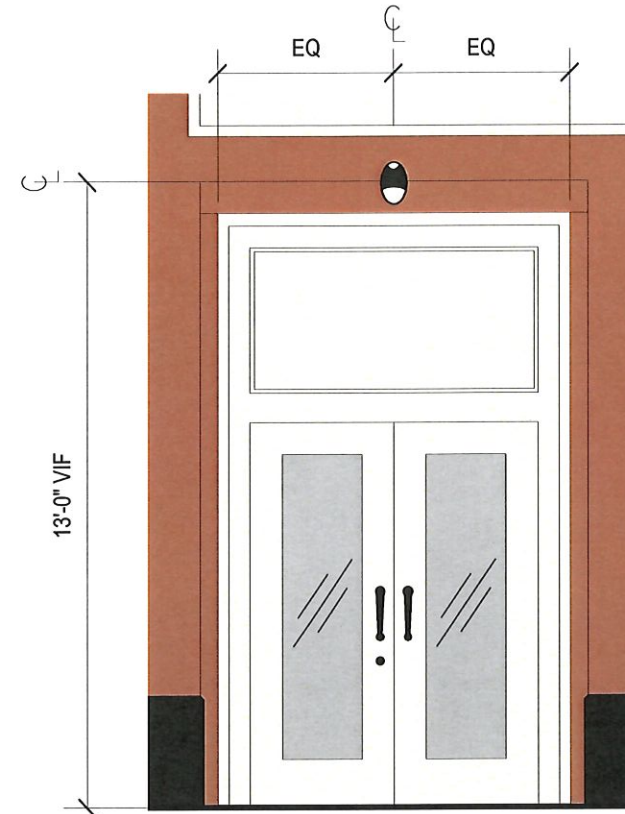
2 ENLARGED ELEVATION Scale: 1/4" = 1'-0"