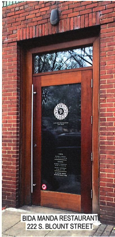
BIDA MANDA RESTAURANT 222 S. BLOUNT STREET