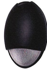
3 LIGHT FIXTURE SELECTION NTS