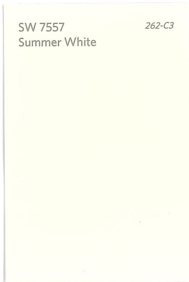
Former Selection: SW 7557 Summer White

Approved color change from COA 014-16-MW TGT