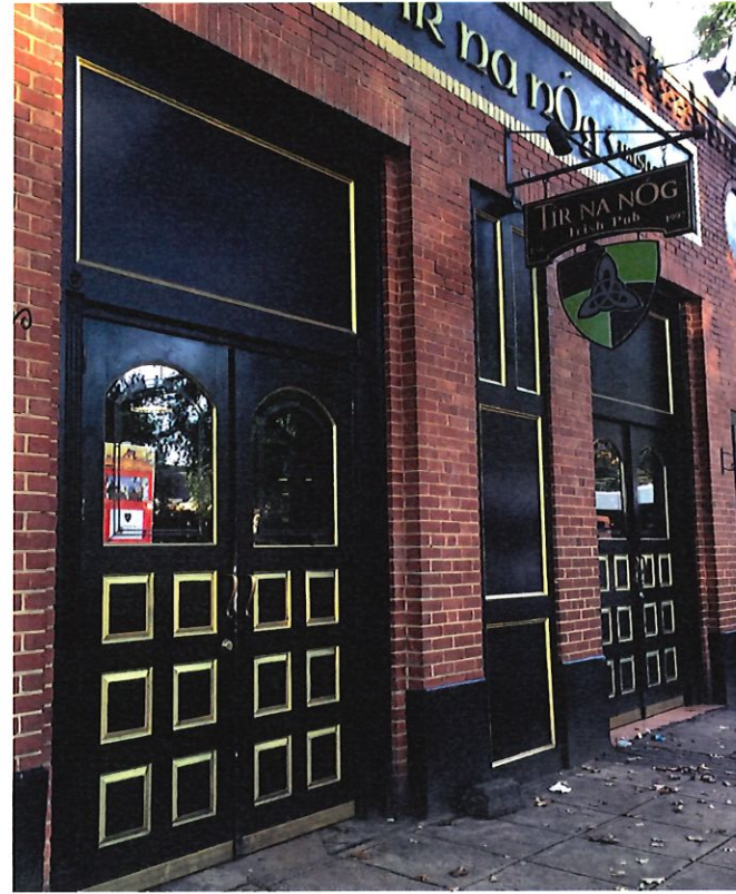
4 EXISTING PHOTO NTS