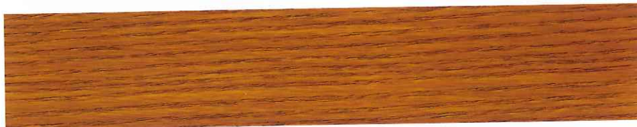
005 Natural Oak