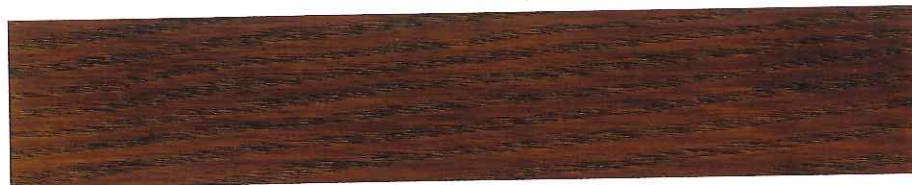
009 Dark Oak

Printed color shown here may vary from actual product colors