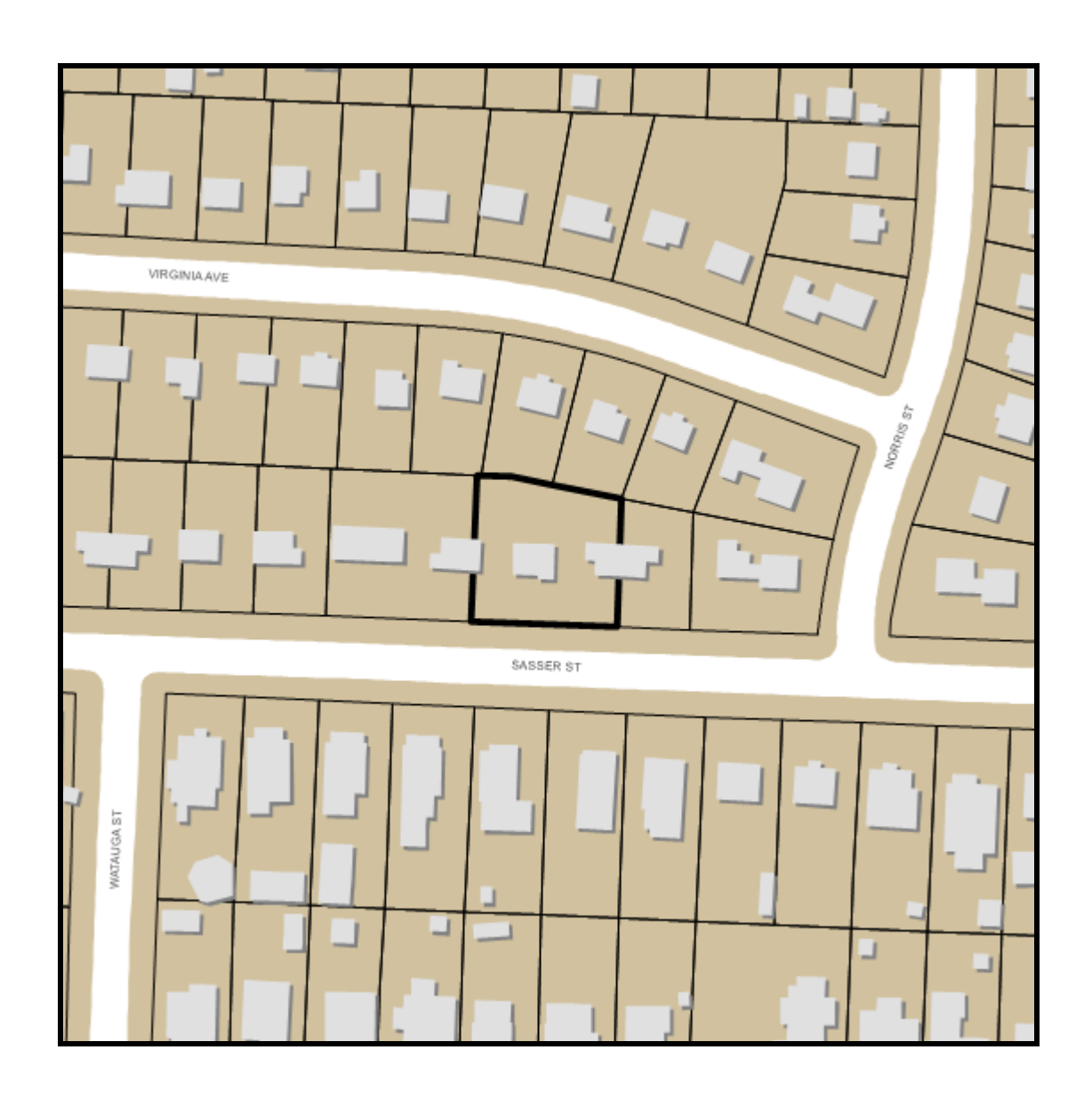
S-65-15 Site Map