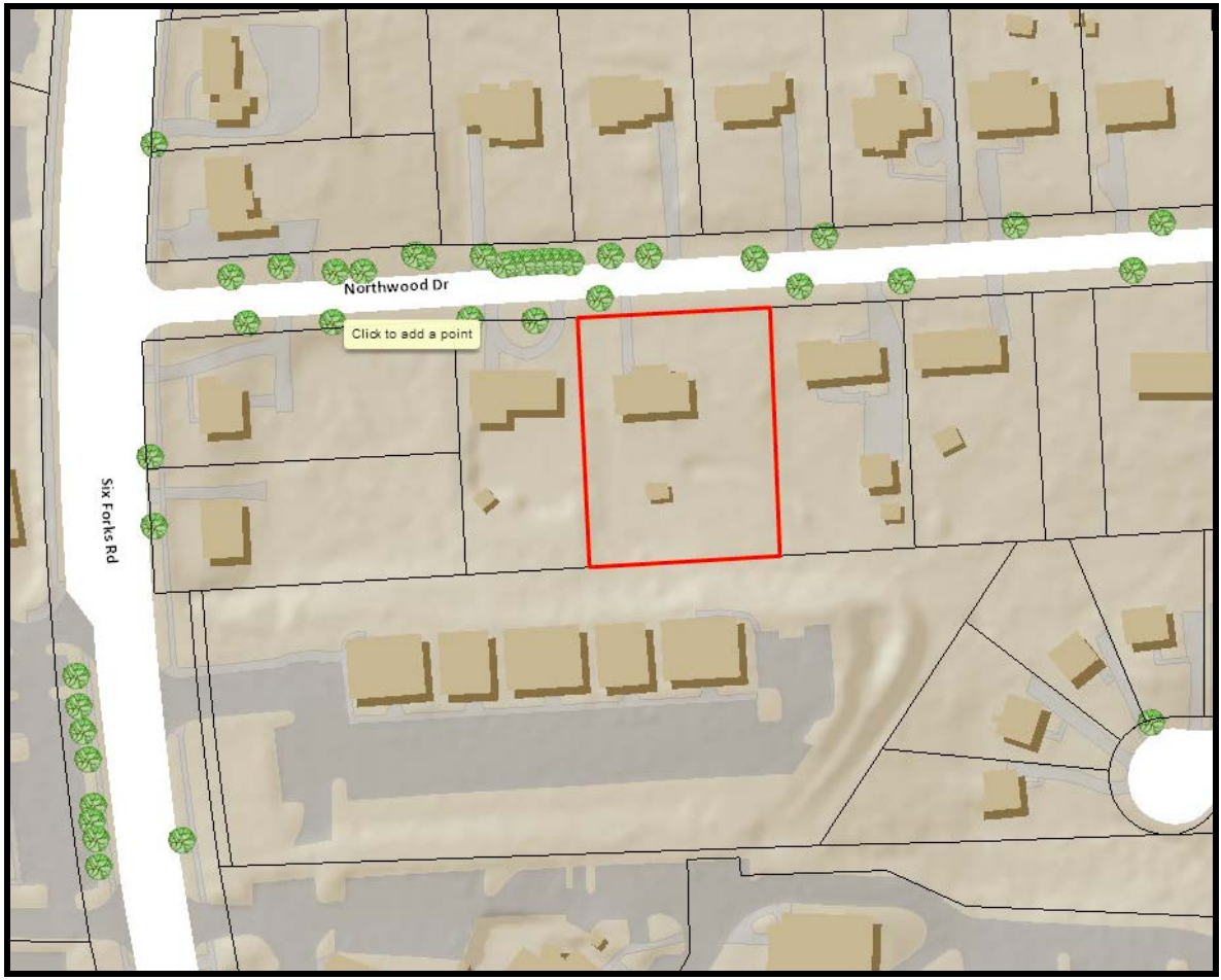
S-56-15 Location Map