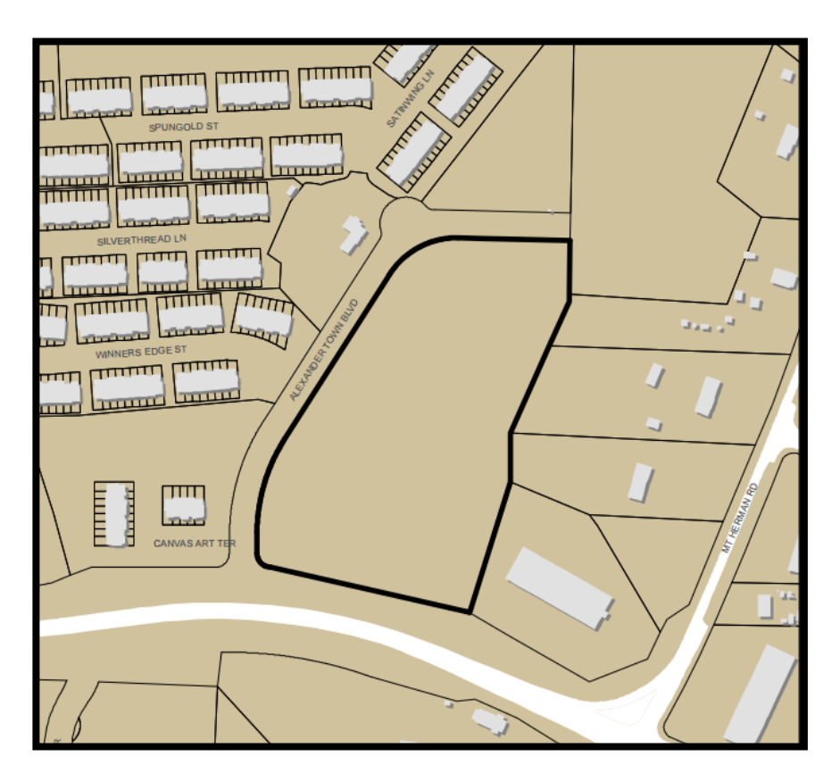
S-46-15 / Location map