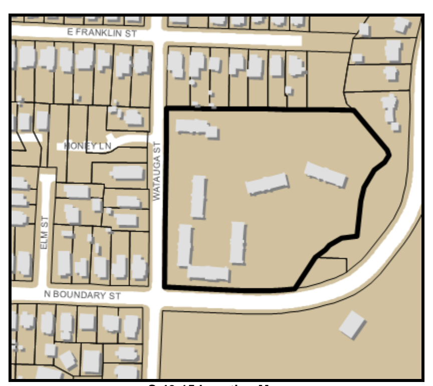
S-40-15 Location Map