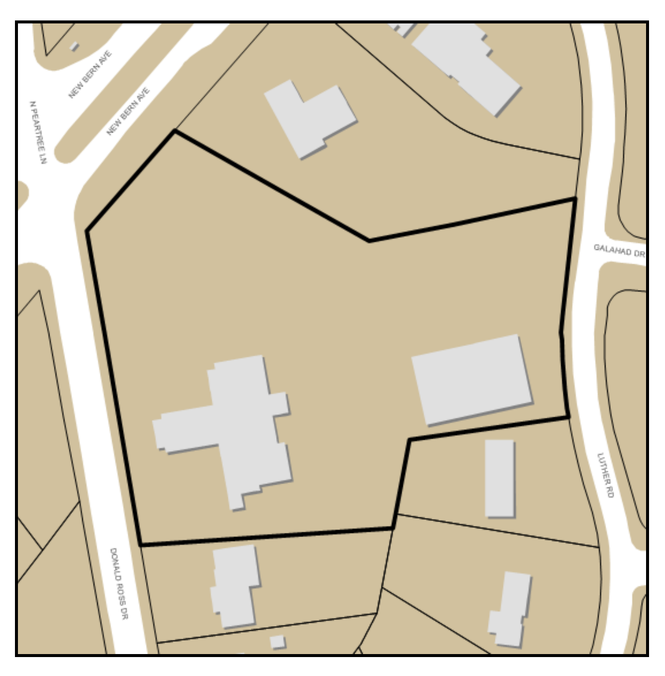
Location Map - 101 Donald Ross Drive