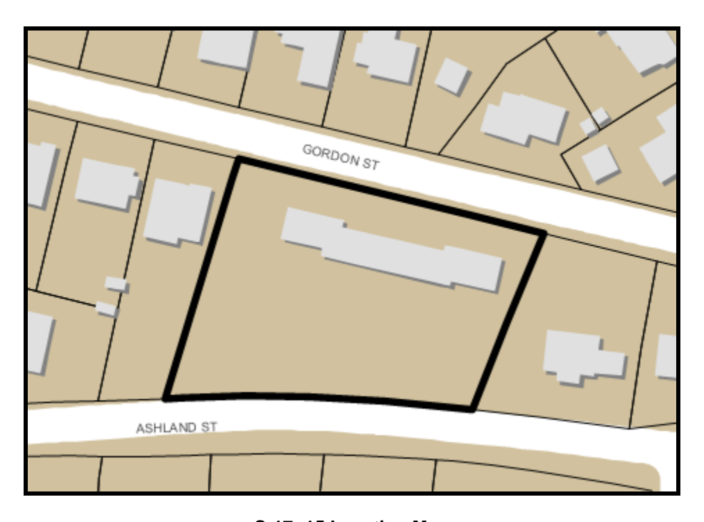
S-17 -15 Location Map