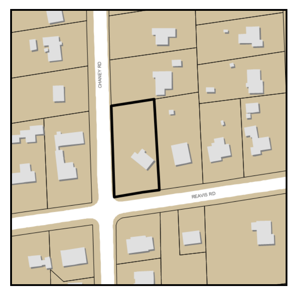
S-16-15 Location Map