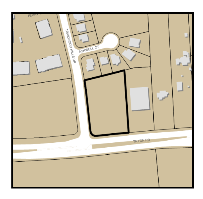
S-11-15 Location Map