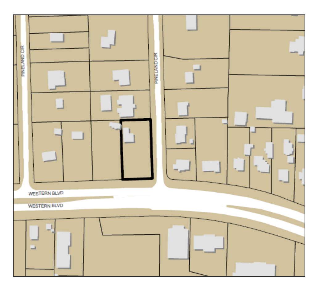
Site Map - 101 Pineland Circle