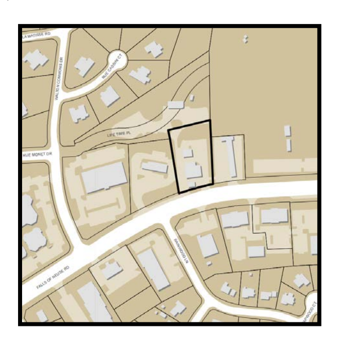
SP-49-15 - Location Map