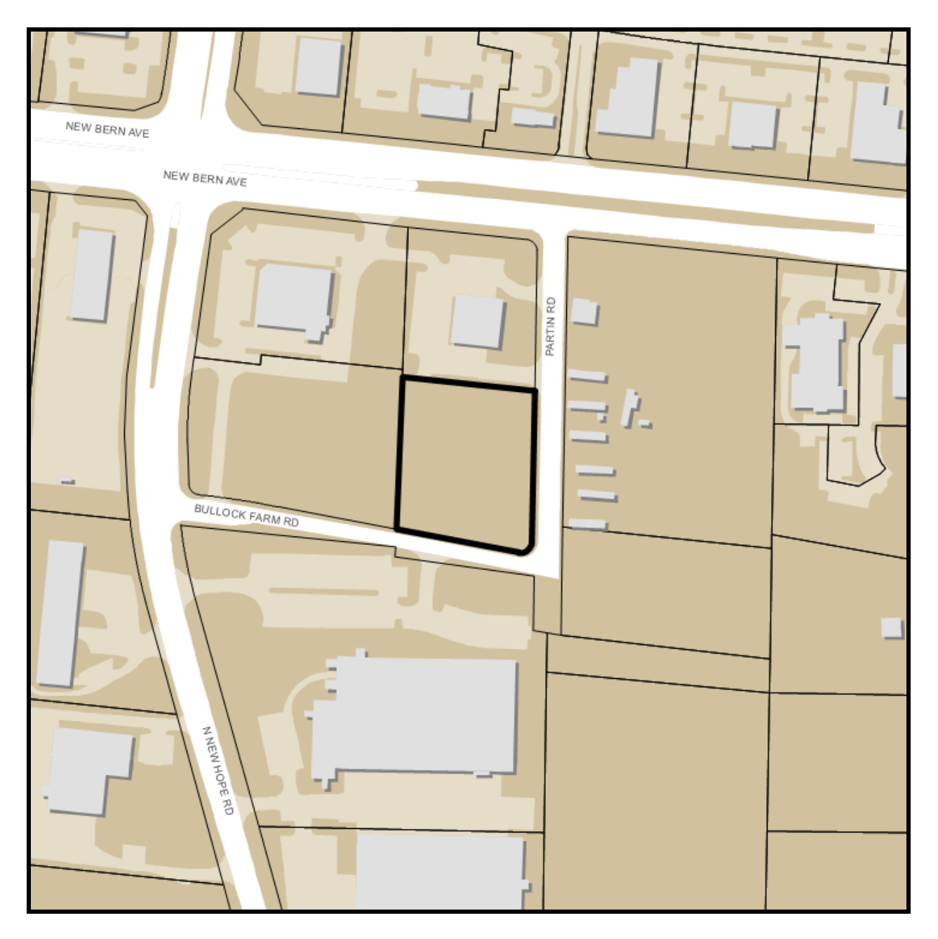
Site Map - 4451 Bullock Farm Road