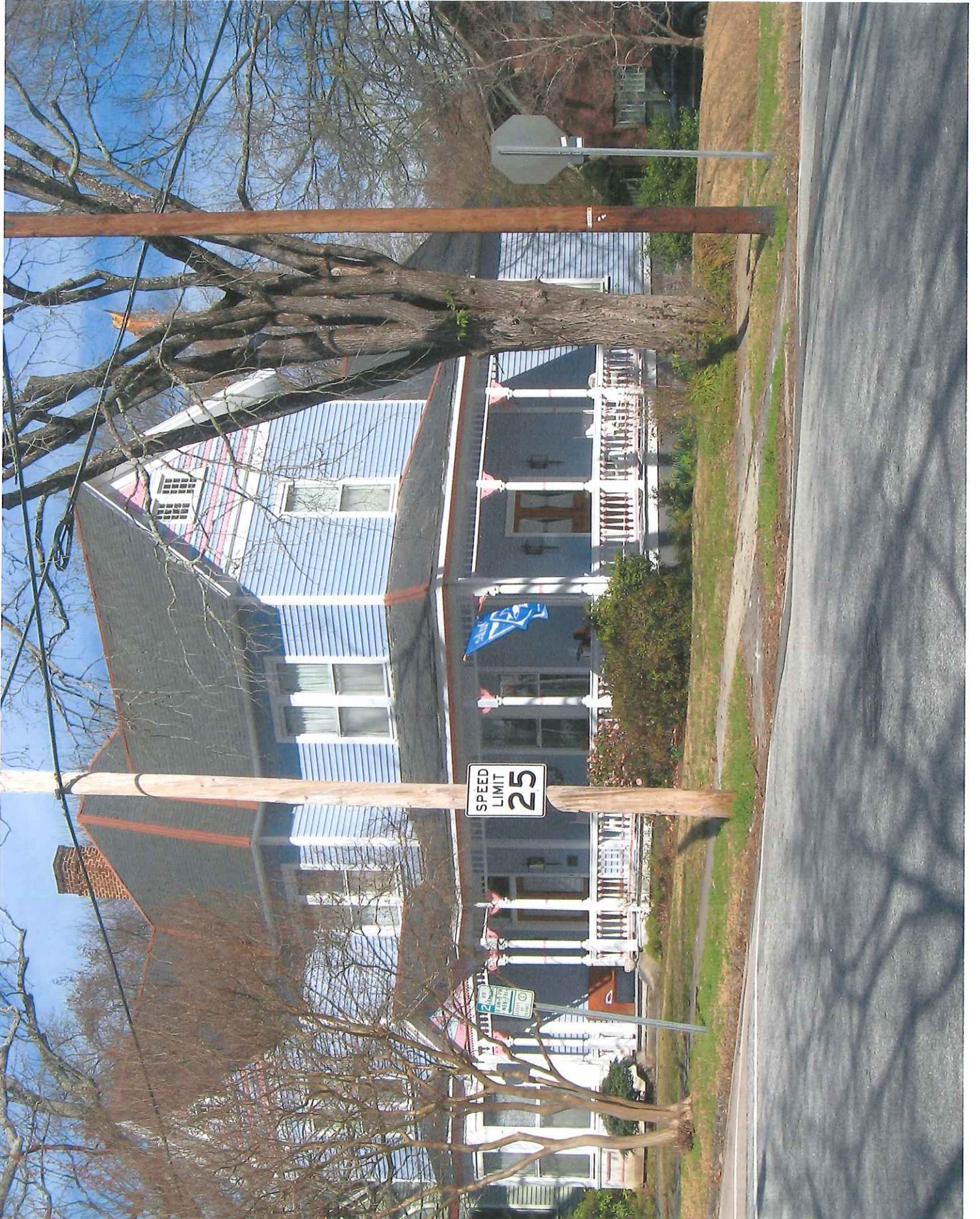
Photo showing dead tree to the right of house