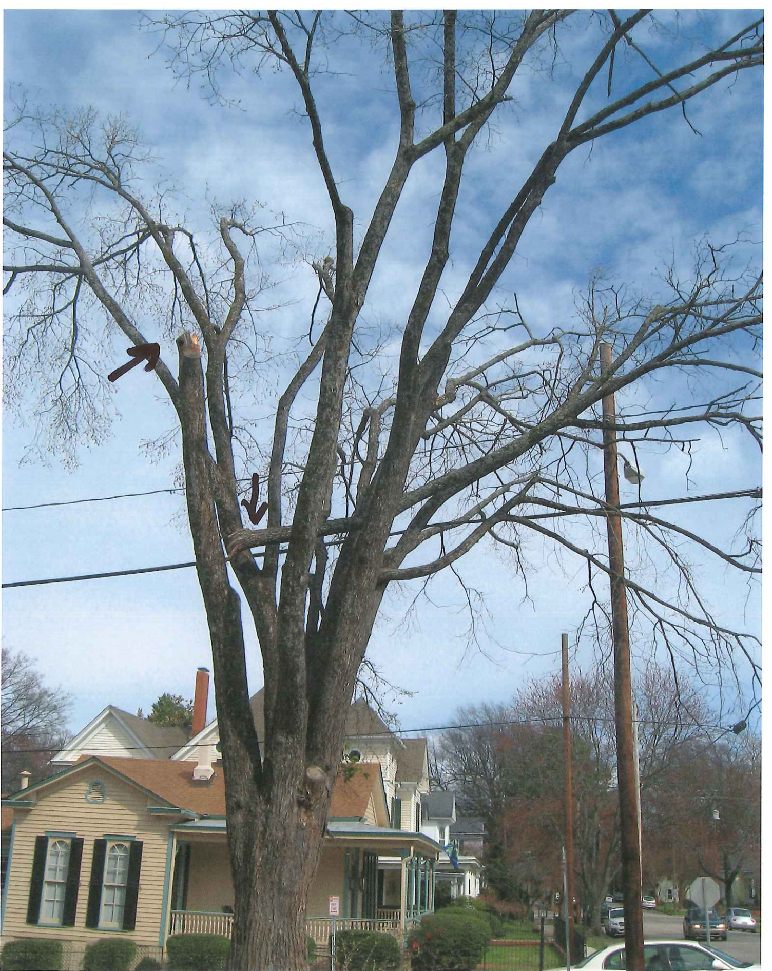
View of tree to be removed