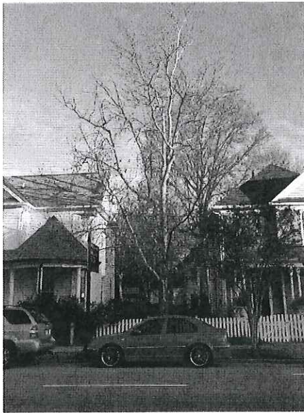
Photo 1 : Indicates the location of the declining Sycamore, oriented on the southwest corner of the lot facing Edenton Street.