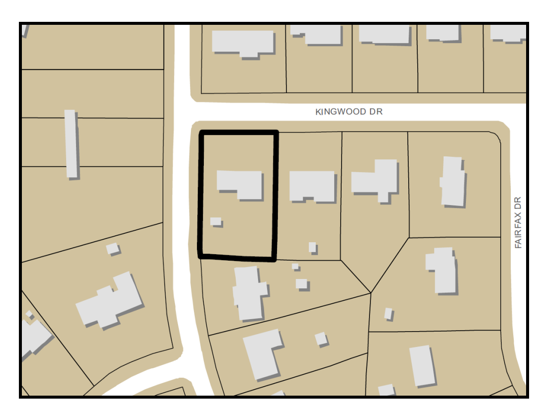
S-57-14 Location Map