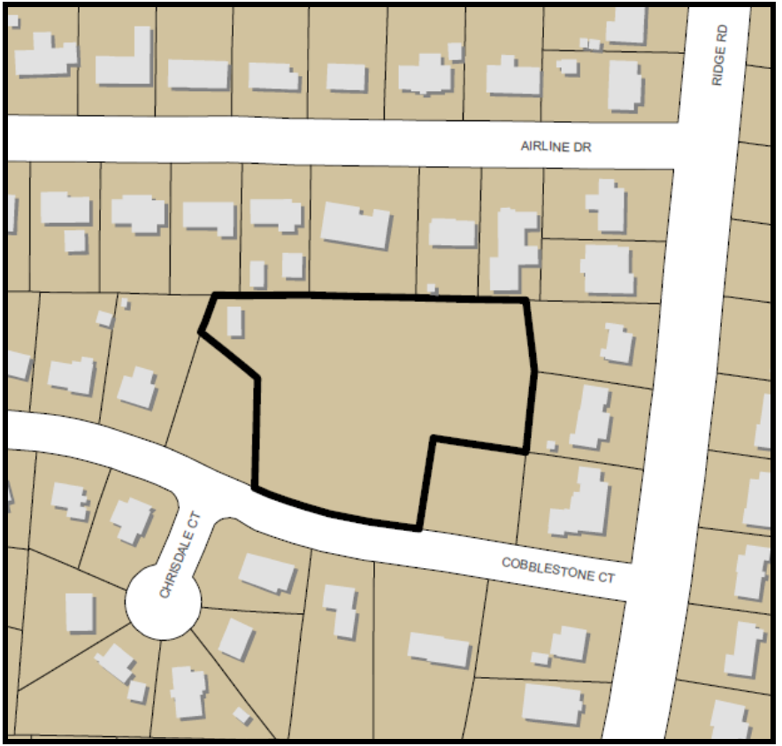
S-25-14 Location Map