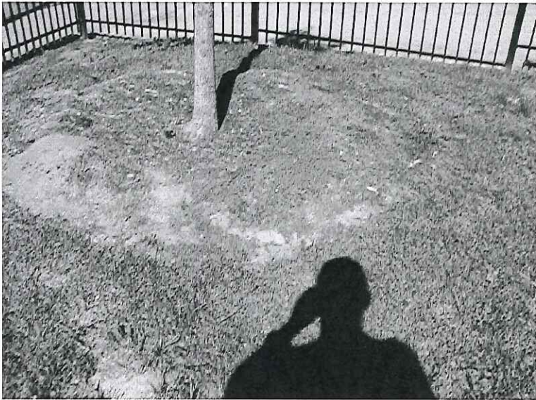
Site of Alpha Howze tree located in O'Rorke-Catholic Cemetery Corner of E. Lane Street and Tarboro Rd