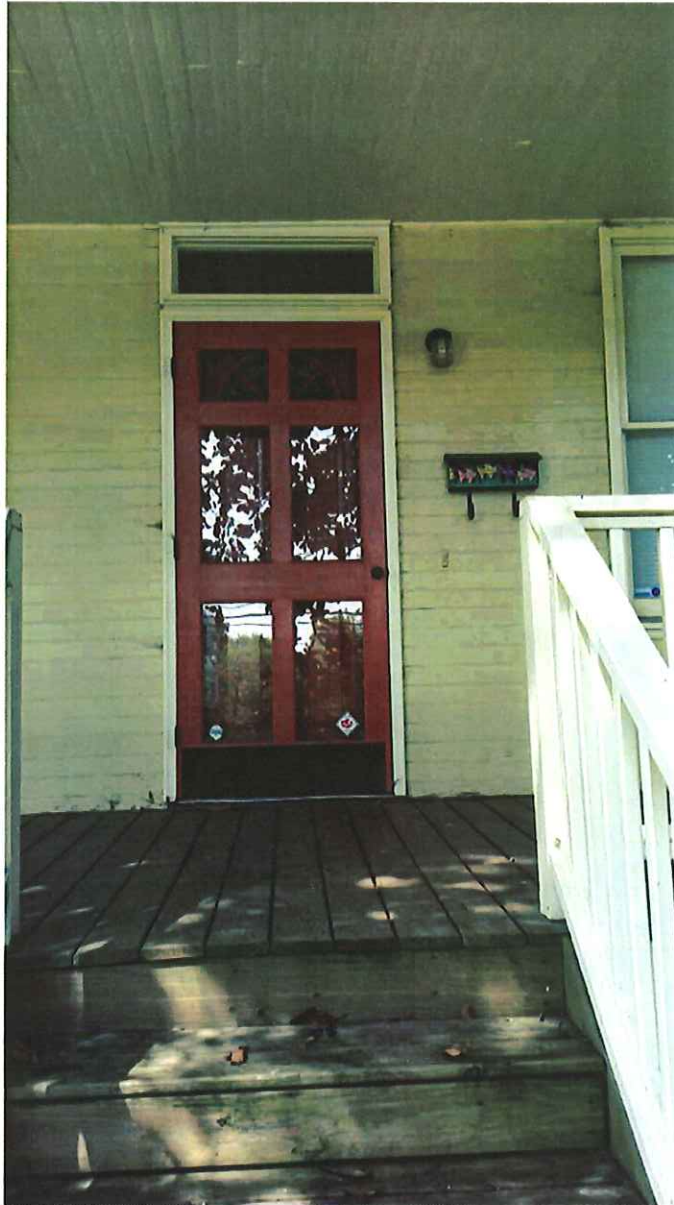
9. 416 Cabarrus – Front Porch