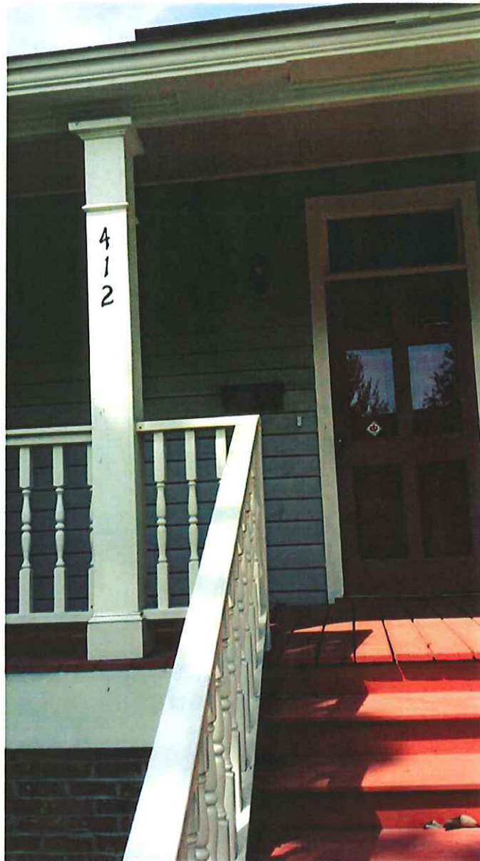
7. 412 Cabarrus – Front Porch