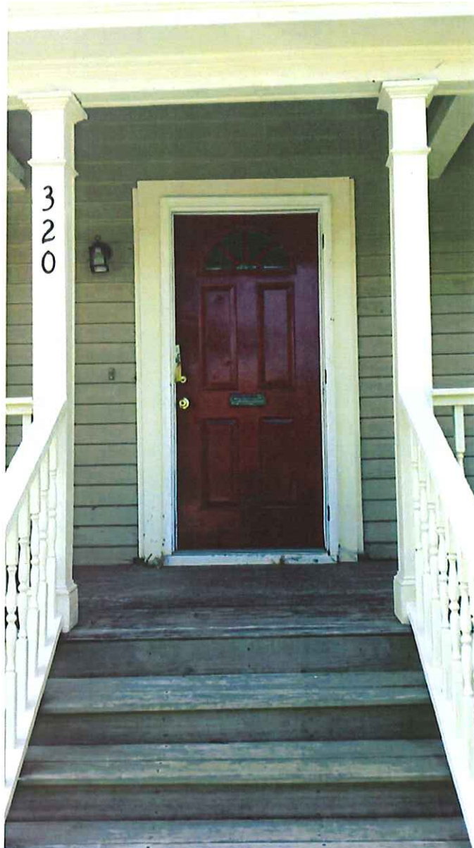
3. 320 E Davie – Front Porch