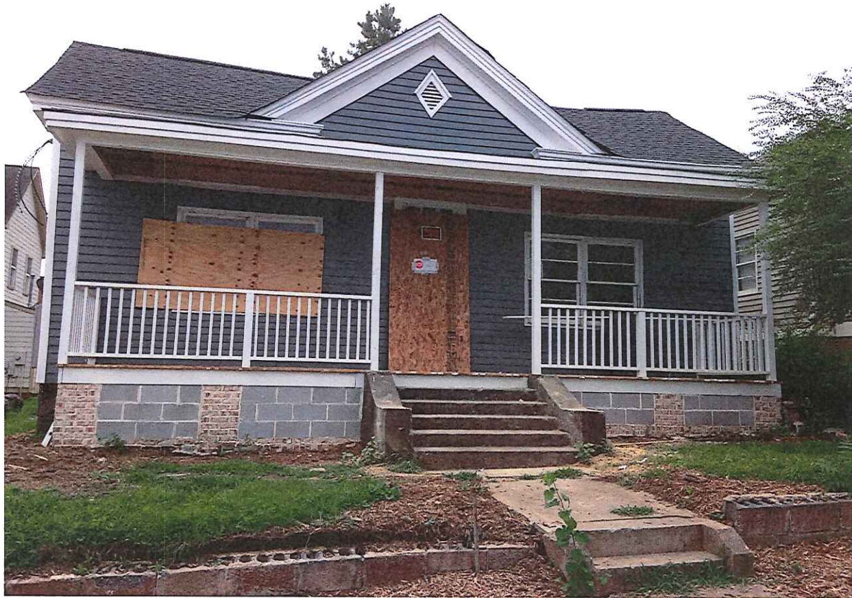
E Davie St 322 2014-08-04 TGT (4)