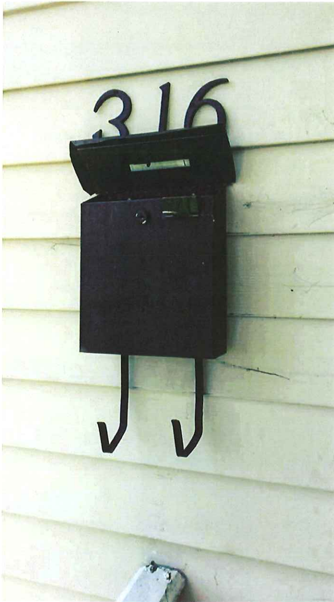
2. 316 E Davie - Mailbox