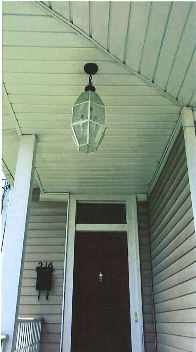
1. 316 E Davie – Front Porch