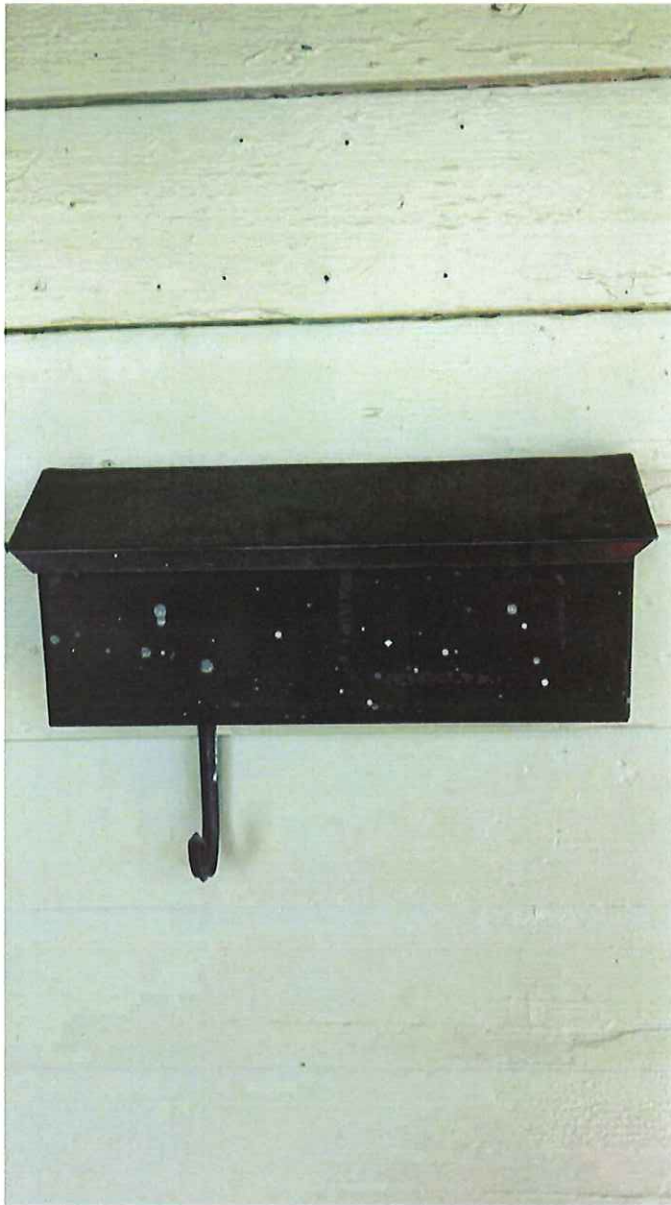
8. 412 Cabarrus – Mailbox