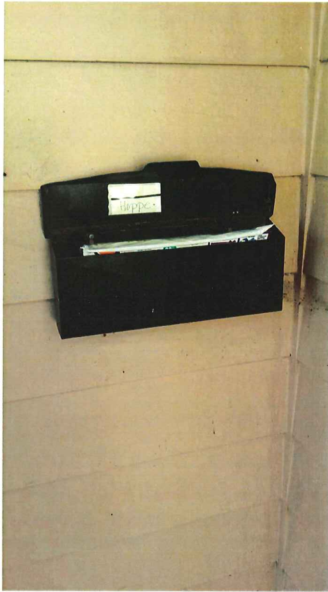
12. 418 Cabarrus – Mailbox