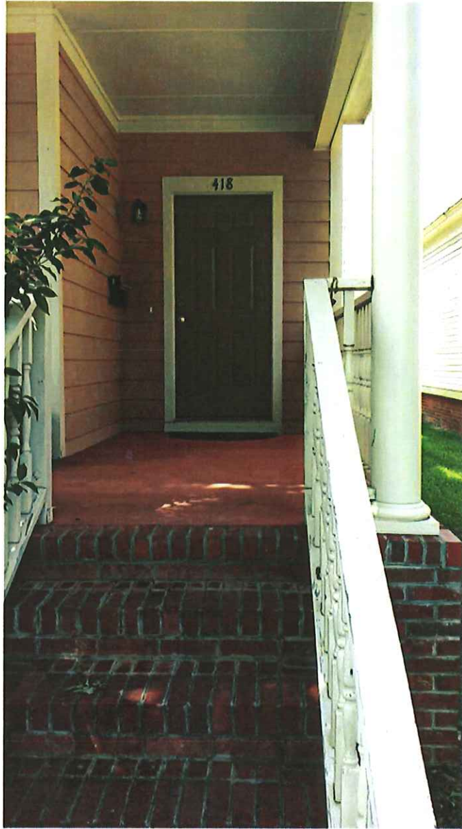
11. 418 Cabarrus – Front Porch