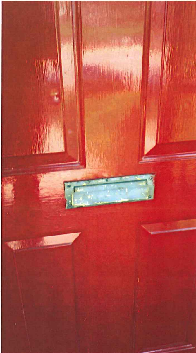
4. 320 E Davie – Mail Slot