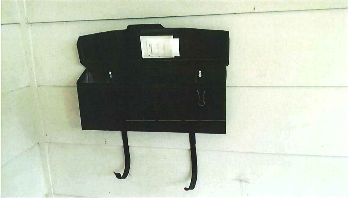
6. 408 Cabarrus – Mailbox