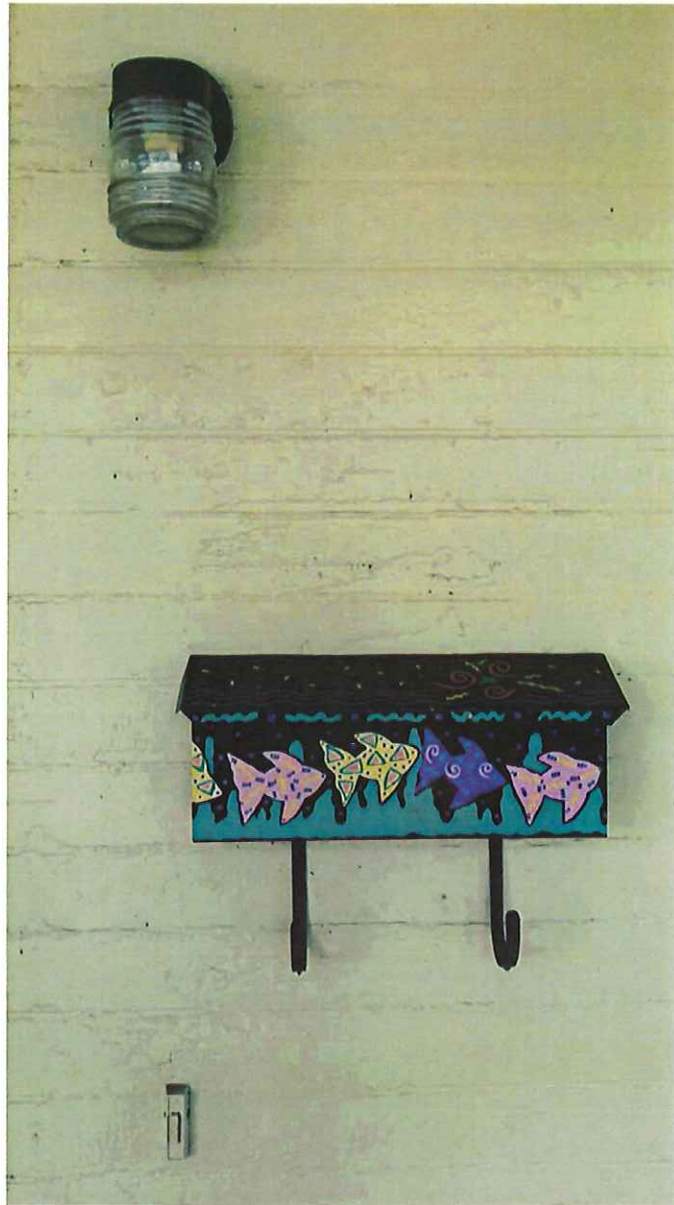
10. 416 Cabarrus – Mailbox