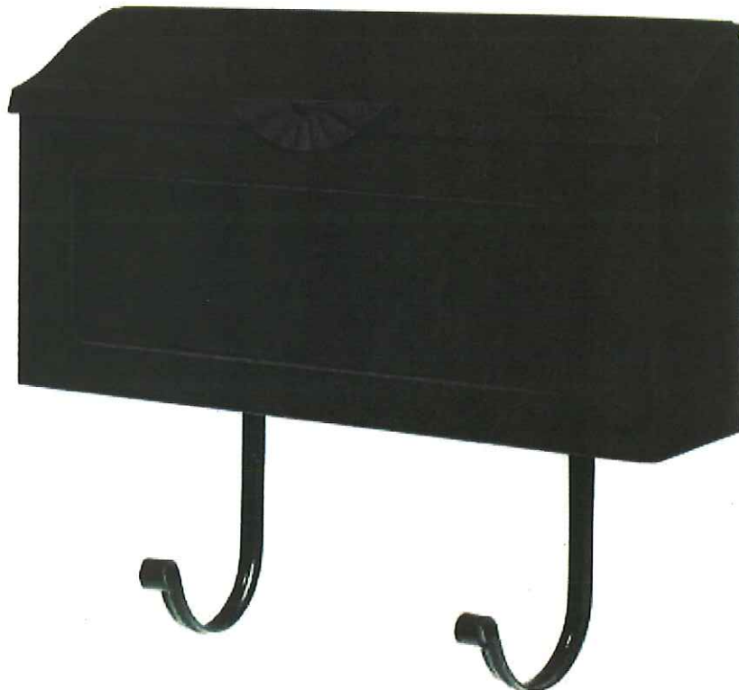
Gibraltar Mailboxes Amboy Black Steel Horizontal Wall-Mount Mailbox, Model # MB676ABK

We are proposing to use a Gibraltar Mailboxes Amboy Black Steel Horizontal Wall-Mount Mailbox, Model # MB676ABK (15.5" wide by 3.75" deep by 8" tall) as pictured below.