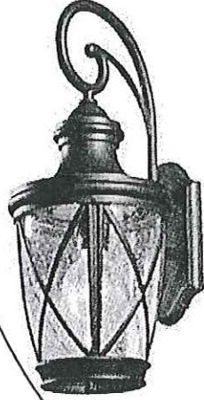
Castine 20.38-in H Rubbed Bronze Outdoor Wall Light