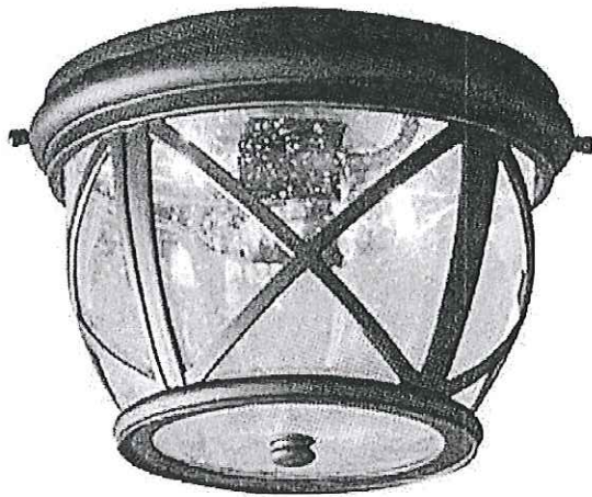
Castine 10.9-in W Bronze Outdoor Flush-Mount Light