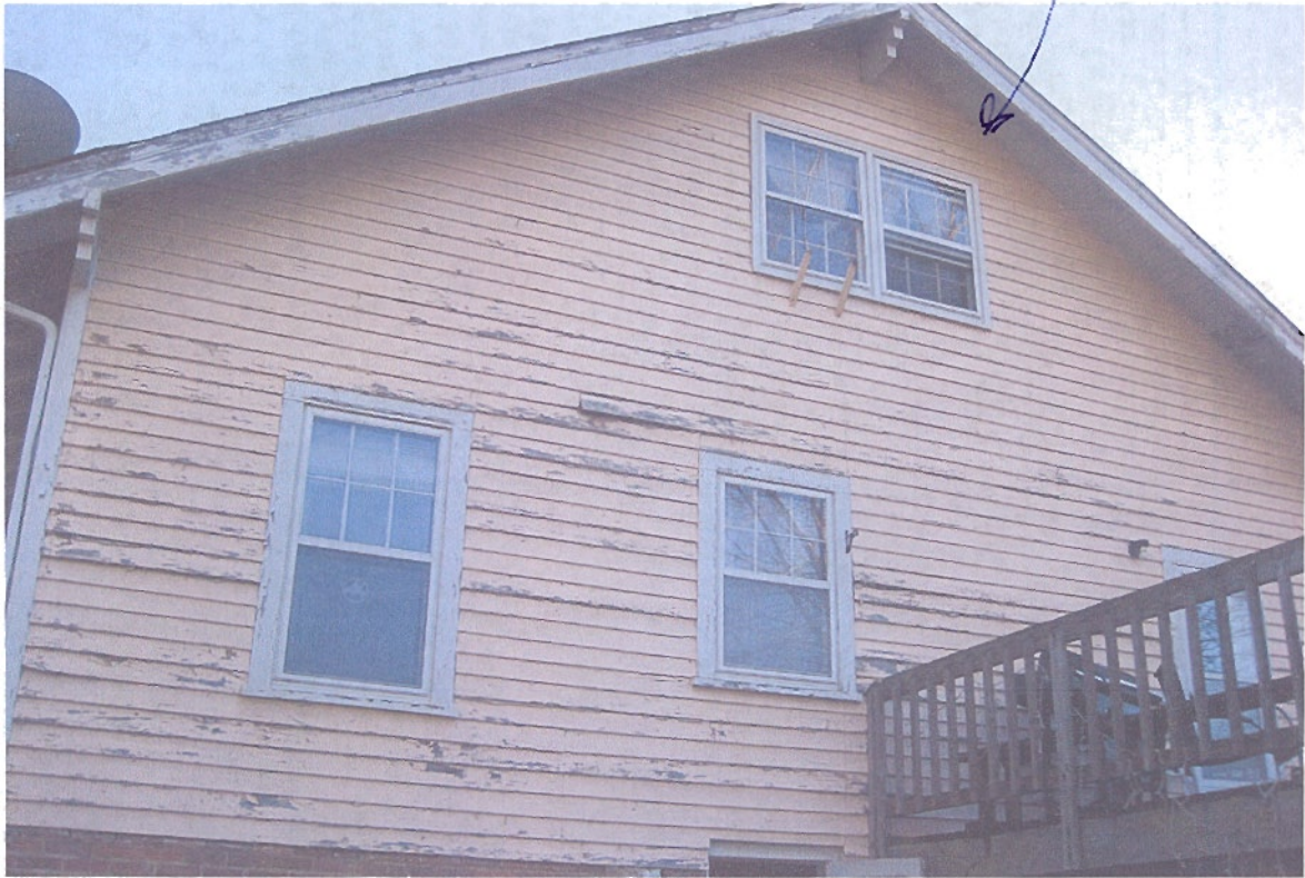
Window & Rear Elevation