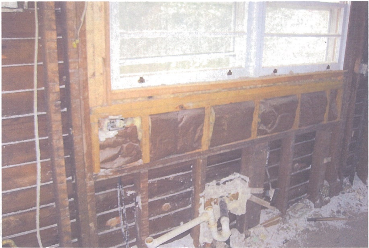
Kitchen Window (interior)