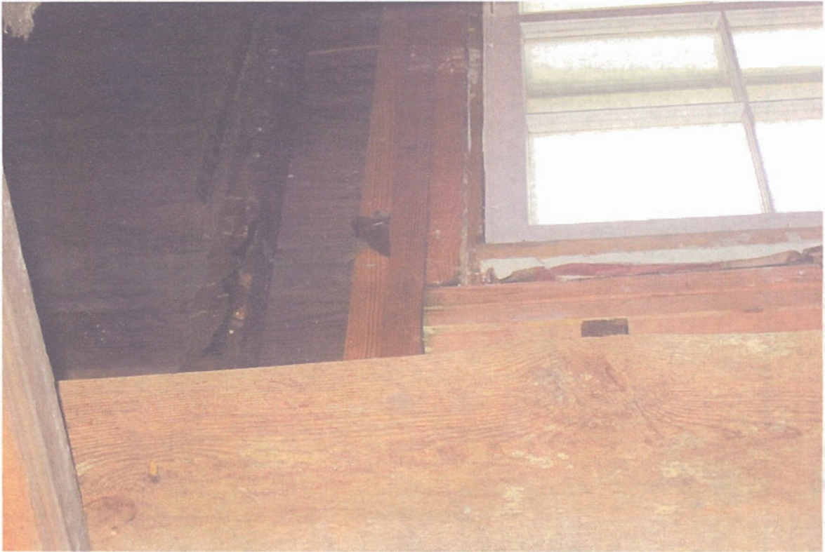
Window @ Rear Elevation (interior)