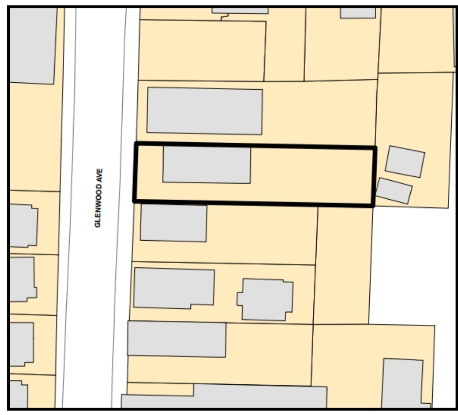
SP-60-13 / Location Map