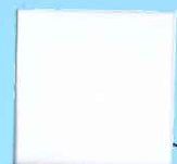
5003-9C Lyndhurst Celestial Blue