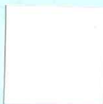
5003-9A River Mist

National Trust for Historic Preservation