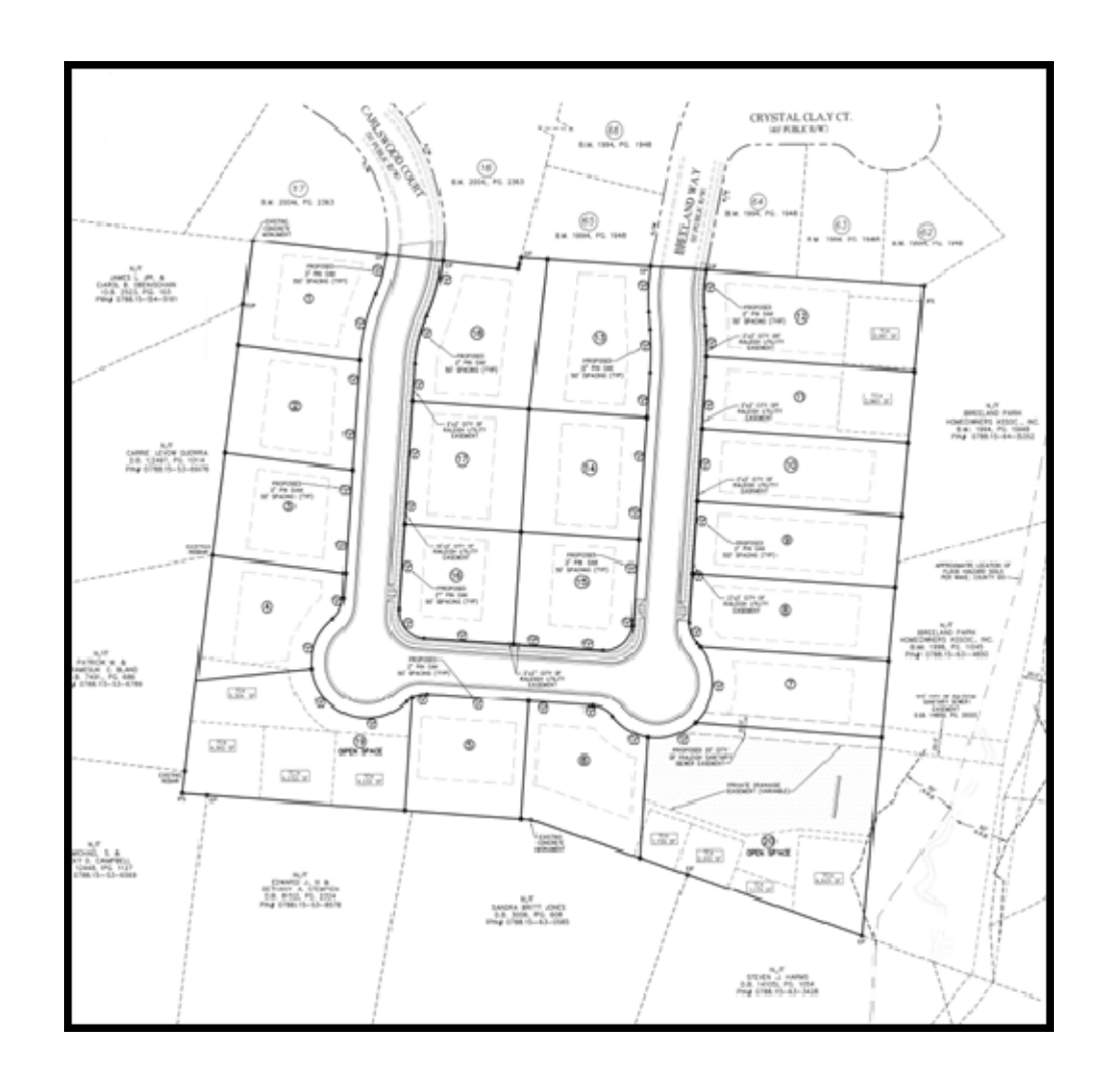
S-20-12 Sanctuary Park – Subdivision Layout