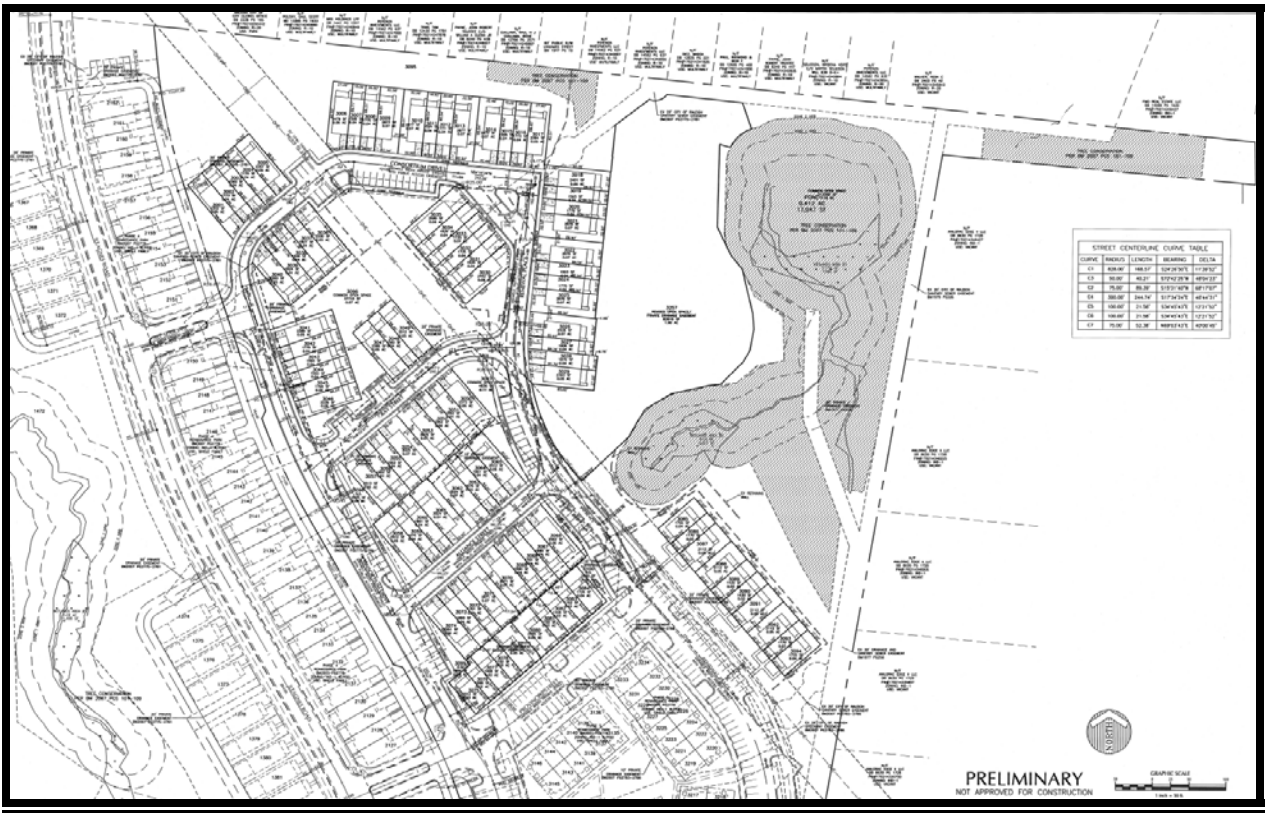
S-8-12 Renaissance Park Phase 8 – Preliminary Site Plan