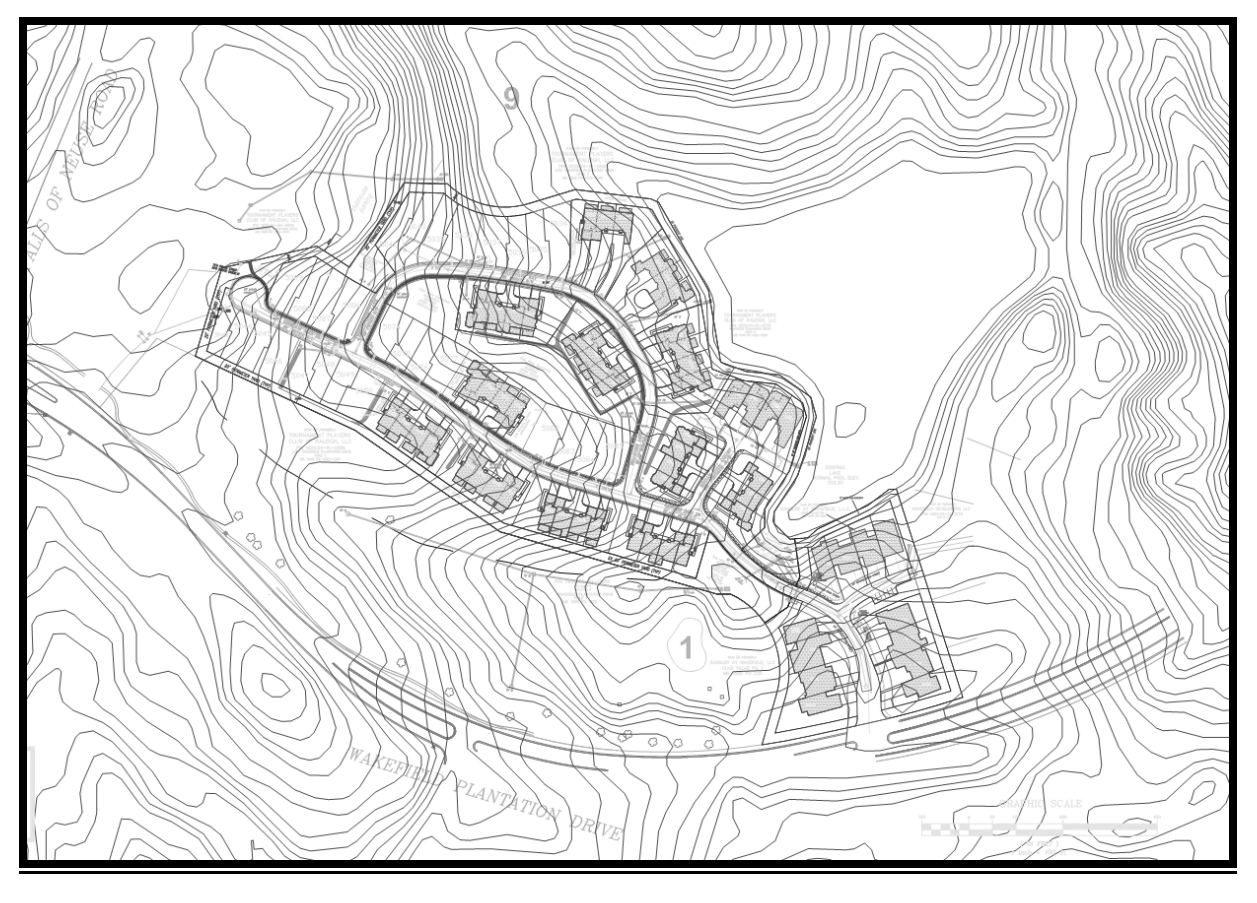
S-6-12 / Wakefield Plantation Club Villas – Subdivision Layout