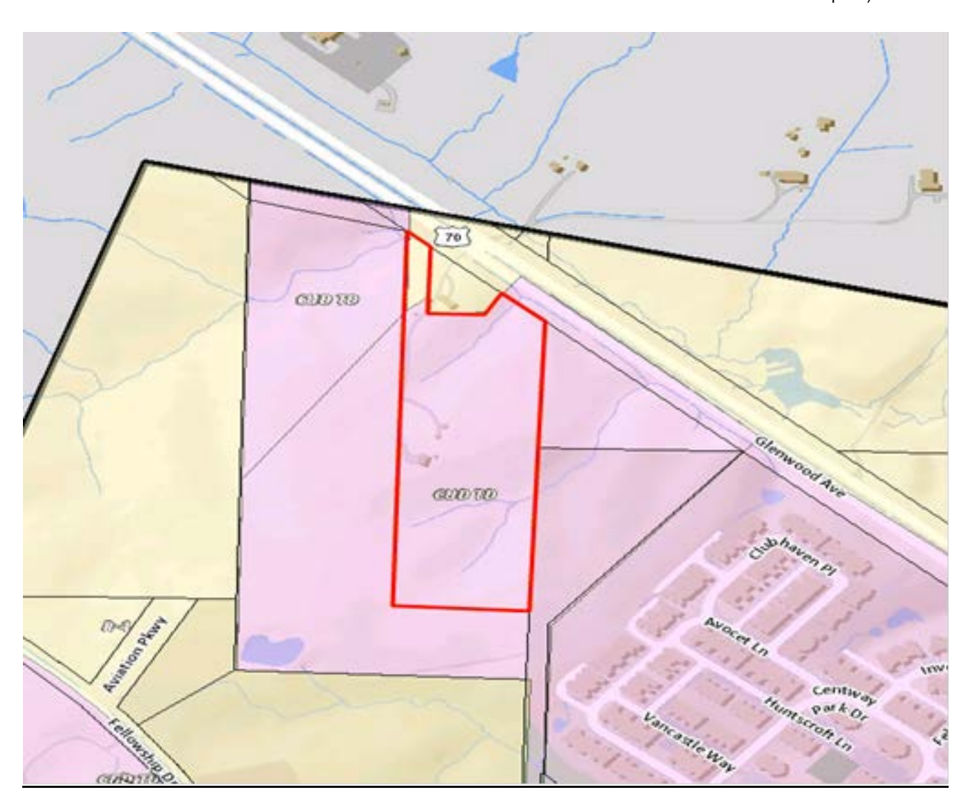
Vicinity Map - 10931 Glenwood Avenue