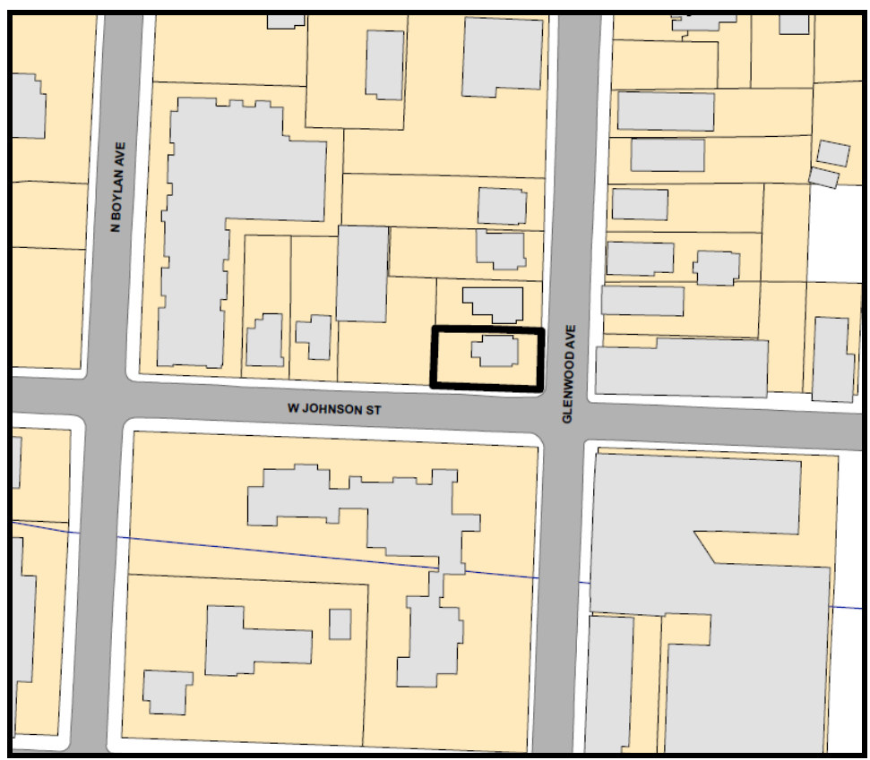
SP-52-11 / 603 Glenwood Avenue – Site Location Map

Contact: Gary McCabe, Red Line Engineering, P.C.