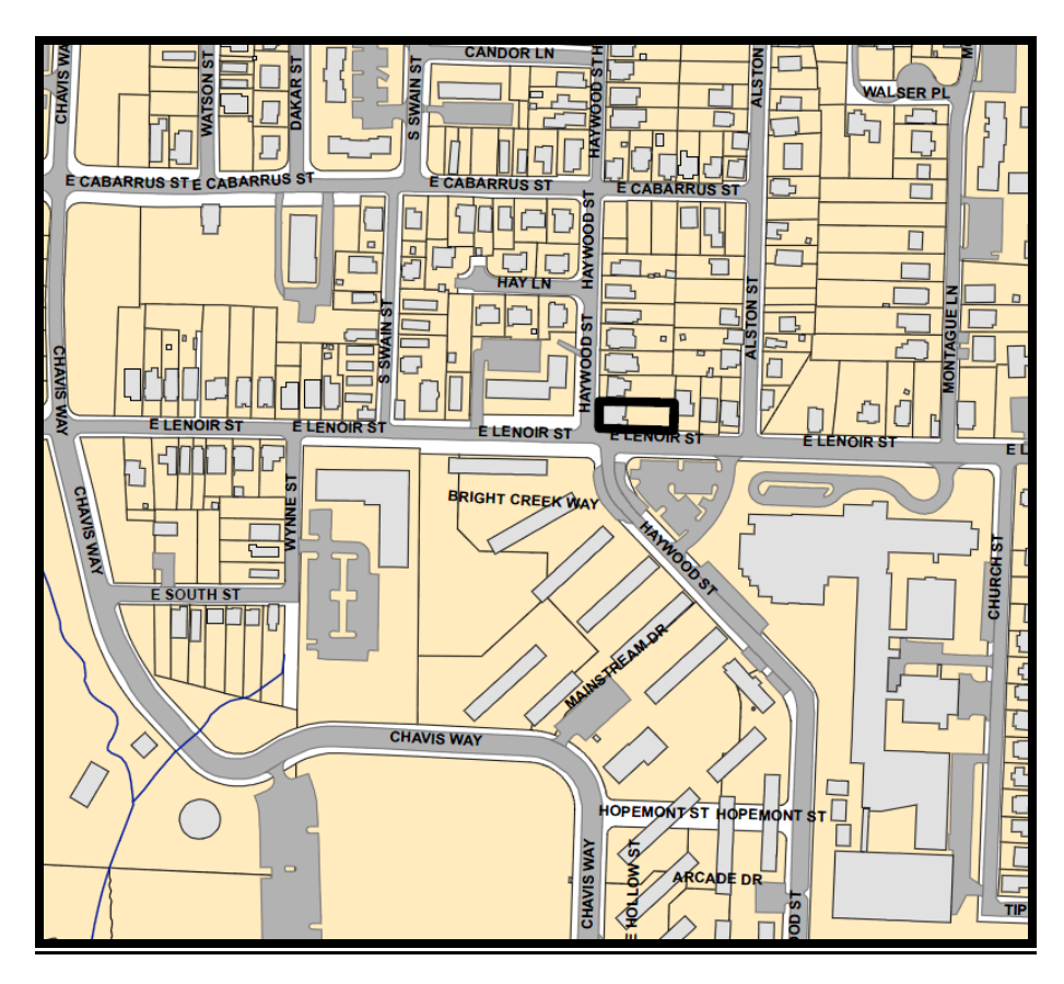
SP-52-09 – Location Map